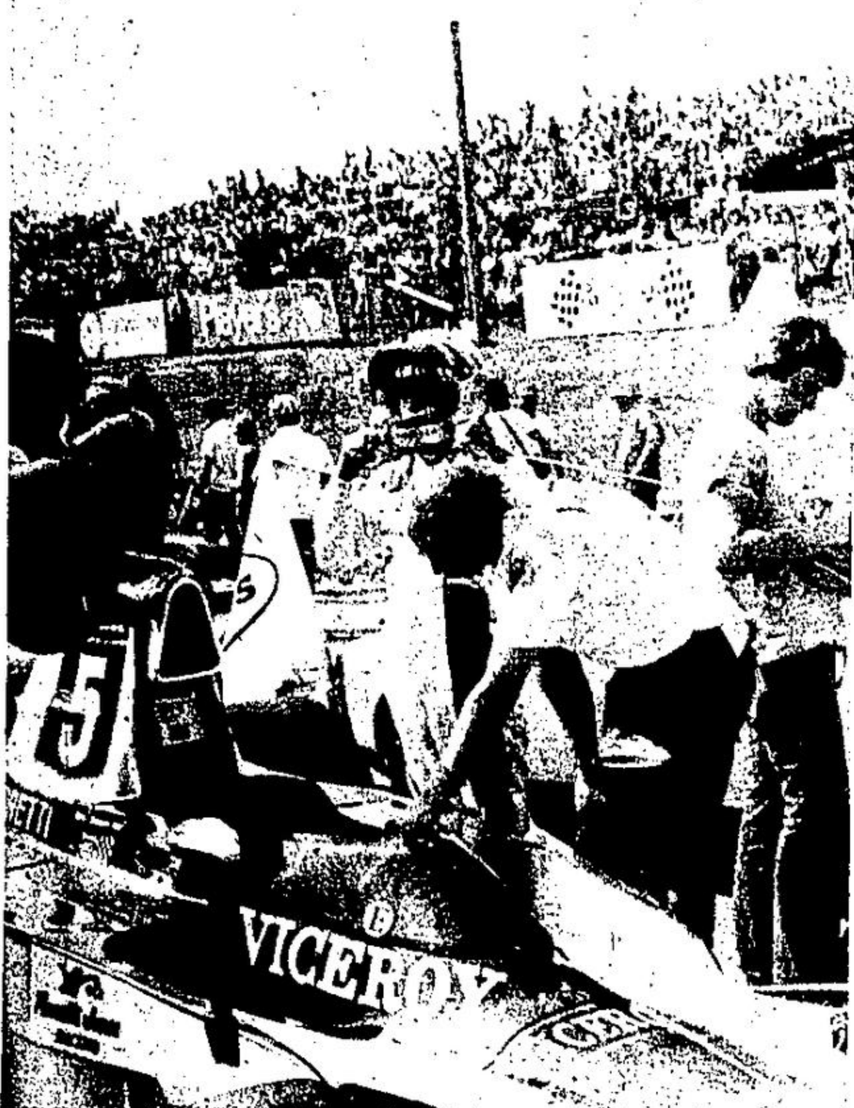
MARIO ANDRETTI prepares to climb into his Lola T400 prior to the start of Sunday's Formula 5000 race at Mosport. Andretti won the race and the first place $15,000 purse by touring the course at an average speed of 116.489 mph.