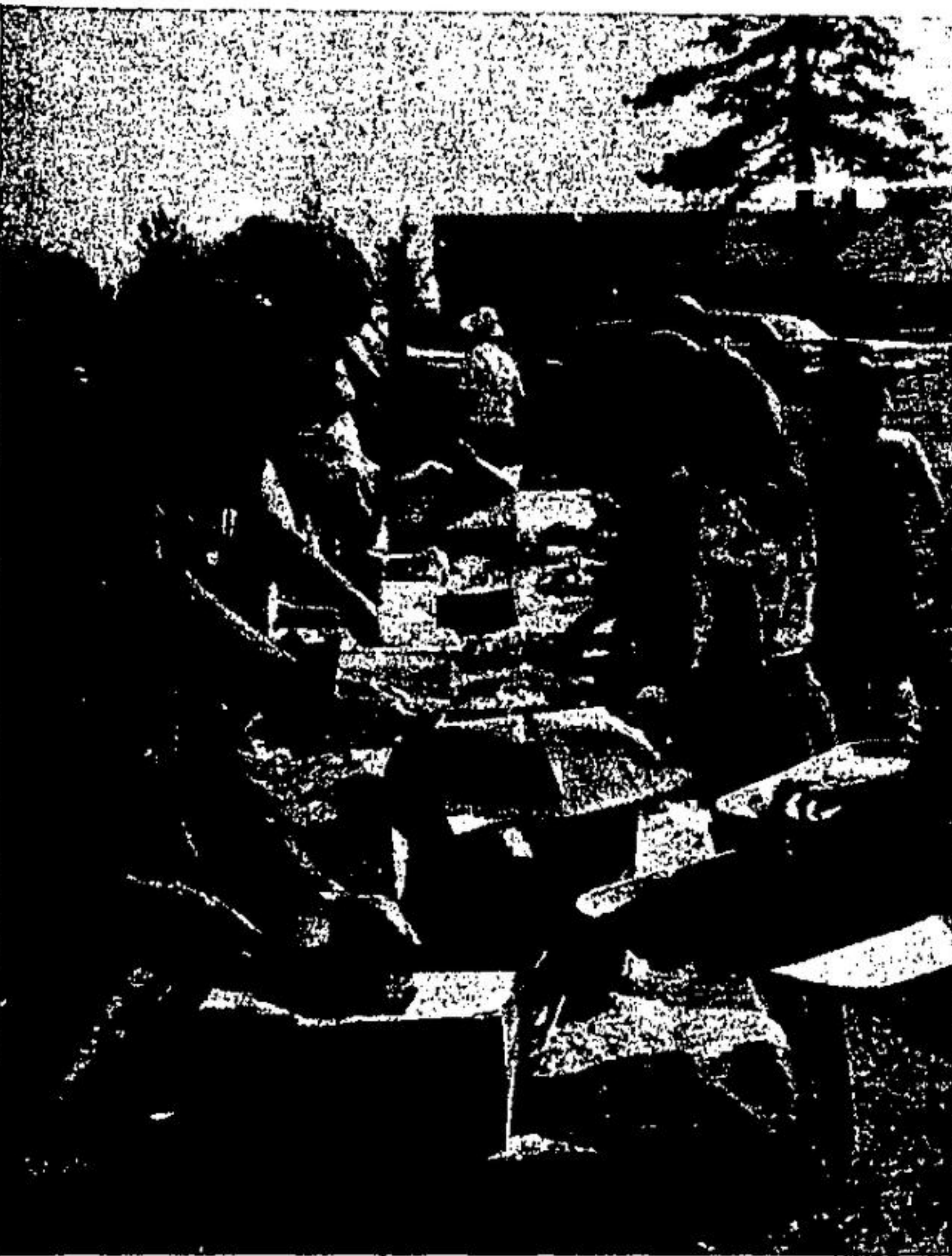
Chicken for all