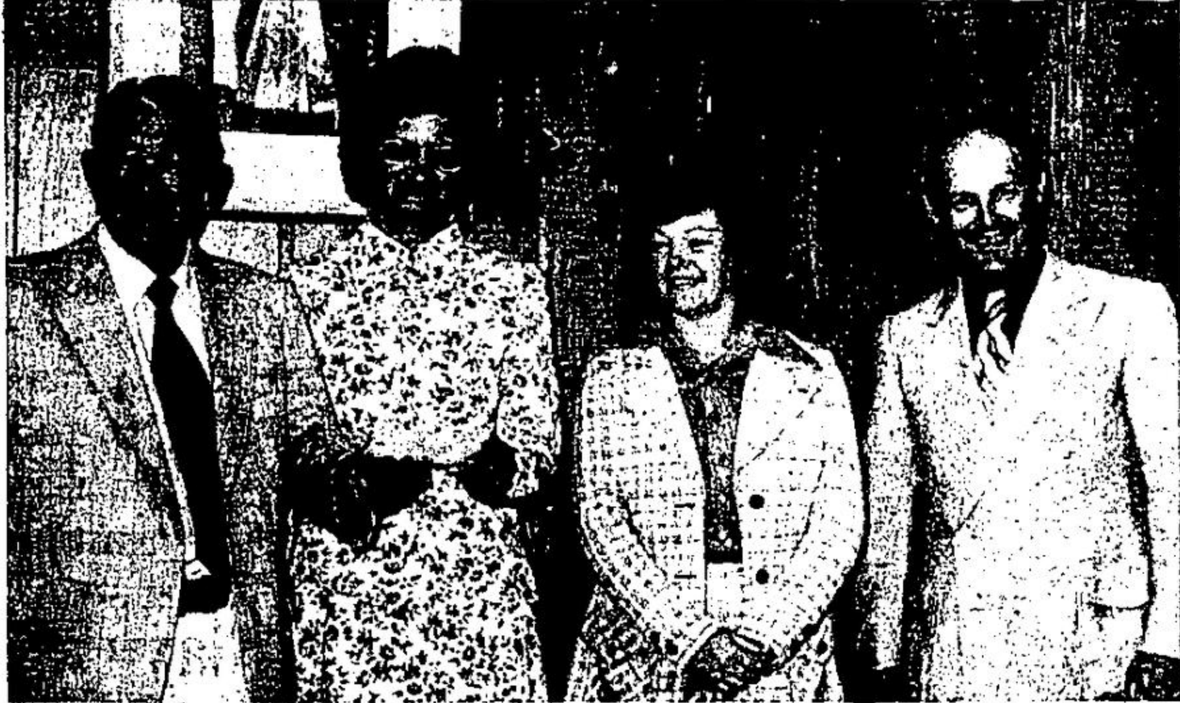
$600 CHEQUE. The Opt-Mrs. of Georgetown presented to the town a cheque for $600 to be used on outfitting the canteen at the Gordon Alcott Memorial Arena. Councillor