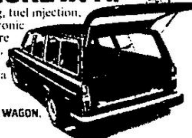
THE 1975 VOLVO WAGON.

You get power steering, fuel injection, steel-belted radials, electronic ignition, tachometer, more comfortable bucket seats. Plus what you could get in it before: a six foot sofa and two chairs.