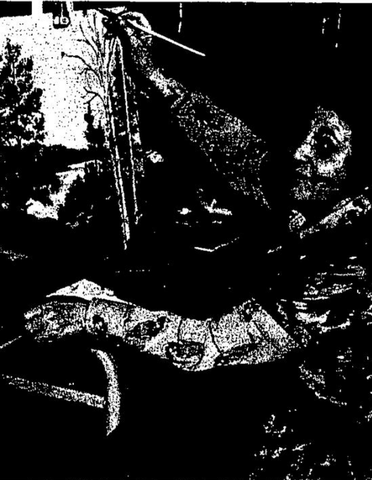
ALL of the Palette and Pencil club for the club's ninth annual sale to be held at Centennial on May 9 to 11.