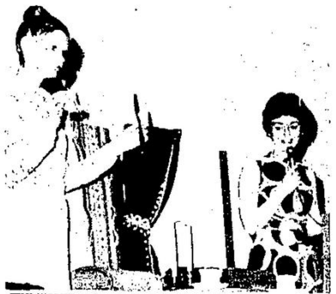
THE WOMEN OF KNOX PRESBYTERIAN CHURCH were treated to a showing of some of the latest wallcoverings as part of the Gracious Living program demonstrated by Sunworthy Wallpapers.