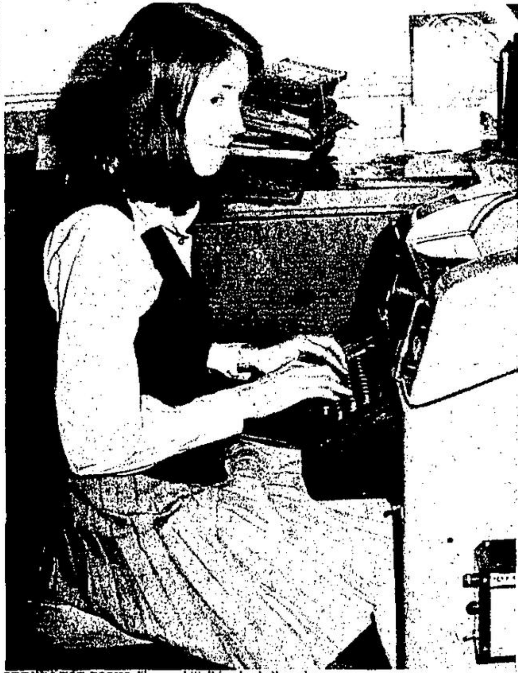
ORDERS FOR BOOKS, films and "talking books" can be placed immediately upon receipt by using the new teletype unit, installed just weeks ago in the Georgetown library. The unit connects all libraries in the South Central Region.

The Halton Hills Public Library is more than just books. It is records, films, and now "talking books" for those that cannot, for various reasons, take advantage of a regular printed book.