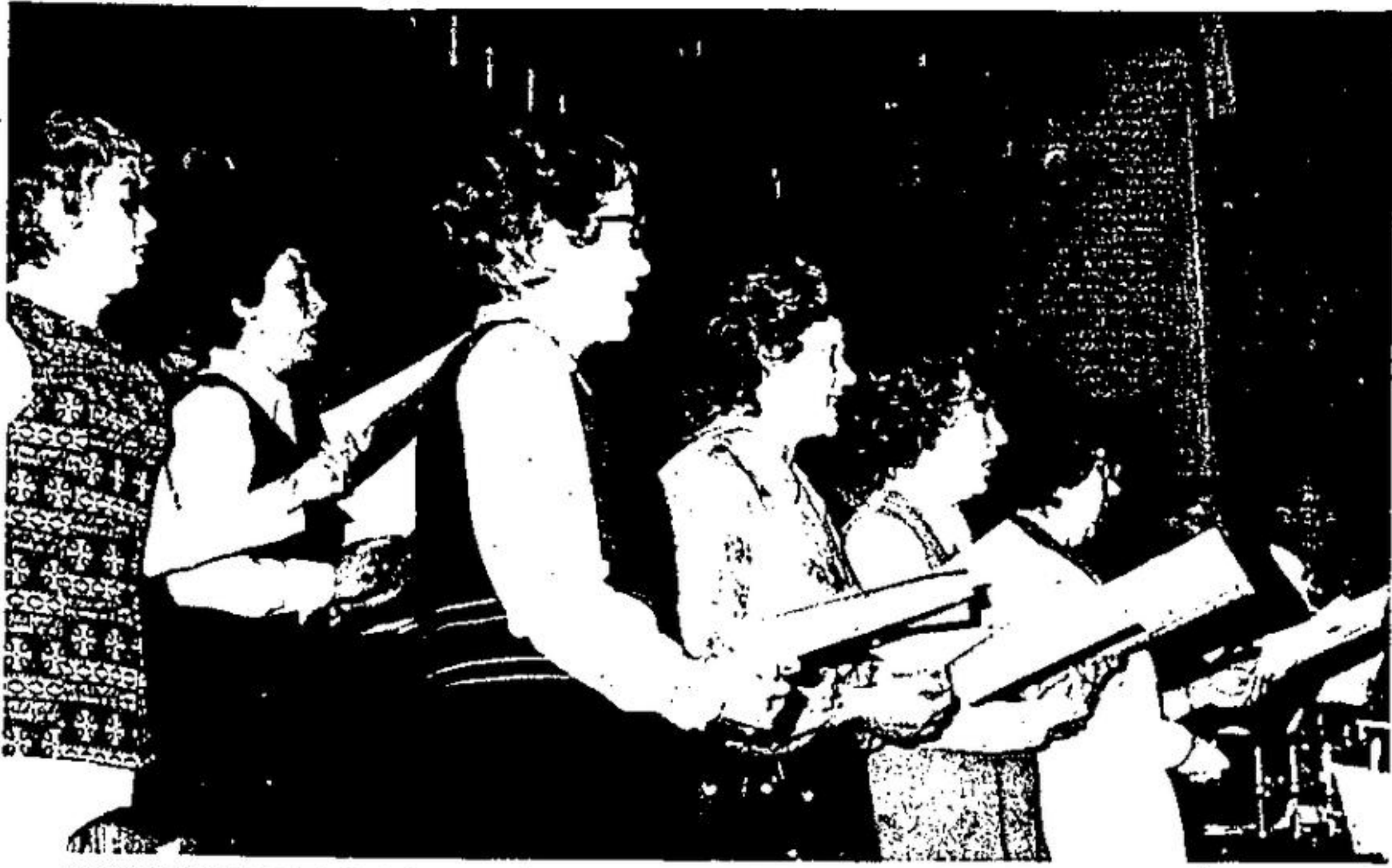
Practising for their annual spring concert are the Georgetown Choral Society. The concert will be held on Saturday, May 10 and Sunday, May 11 at Knox Presbyterian Church. Featured in the concert will be an