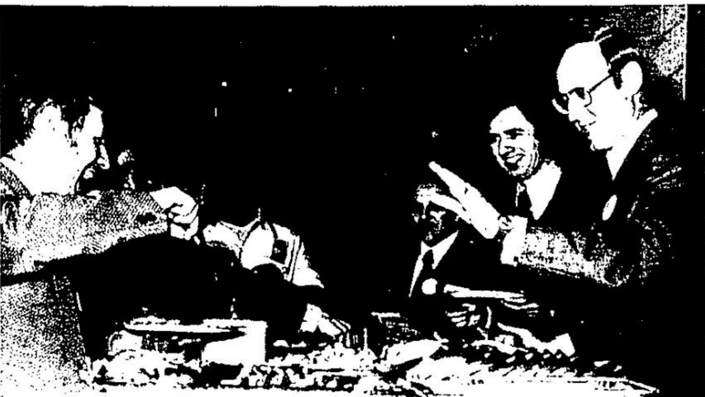
MEMBERS of various fraternal organizations help themselves to the buffet served at the 'Millionaires Night' held in the Holy Cross Auditorium by the Georgetown Knights of Columbus.