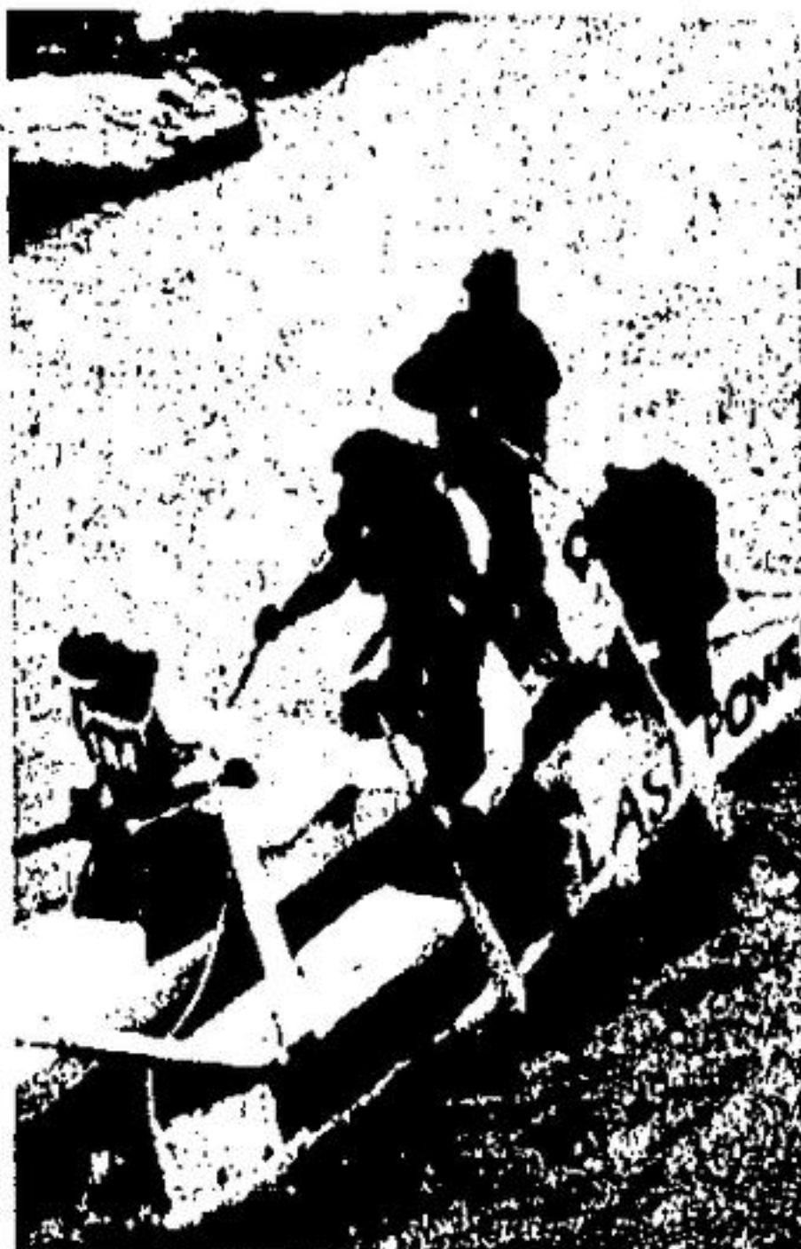
FOUR SOGGY SAILORS used "Flash Power" to sail the seven miles to the end of the course where they were welcomed to the hospitality room at the Credit Valley Club in Norval with coffee, warmth, change rooms, and a chance to dry out before the dance.