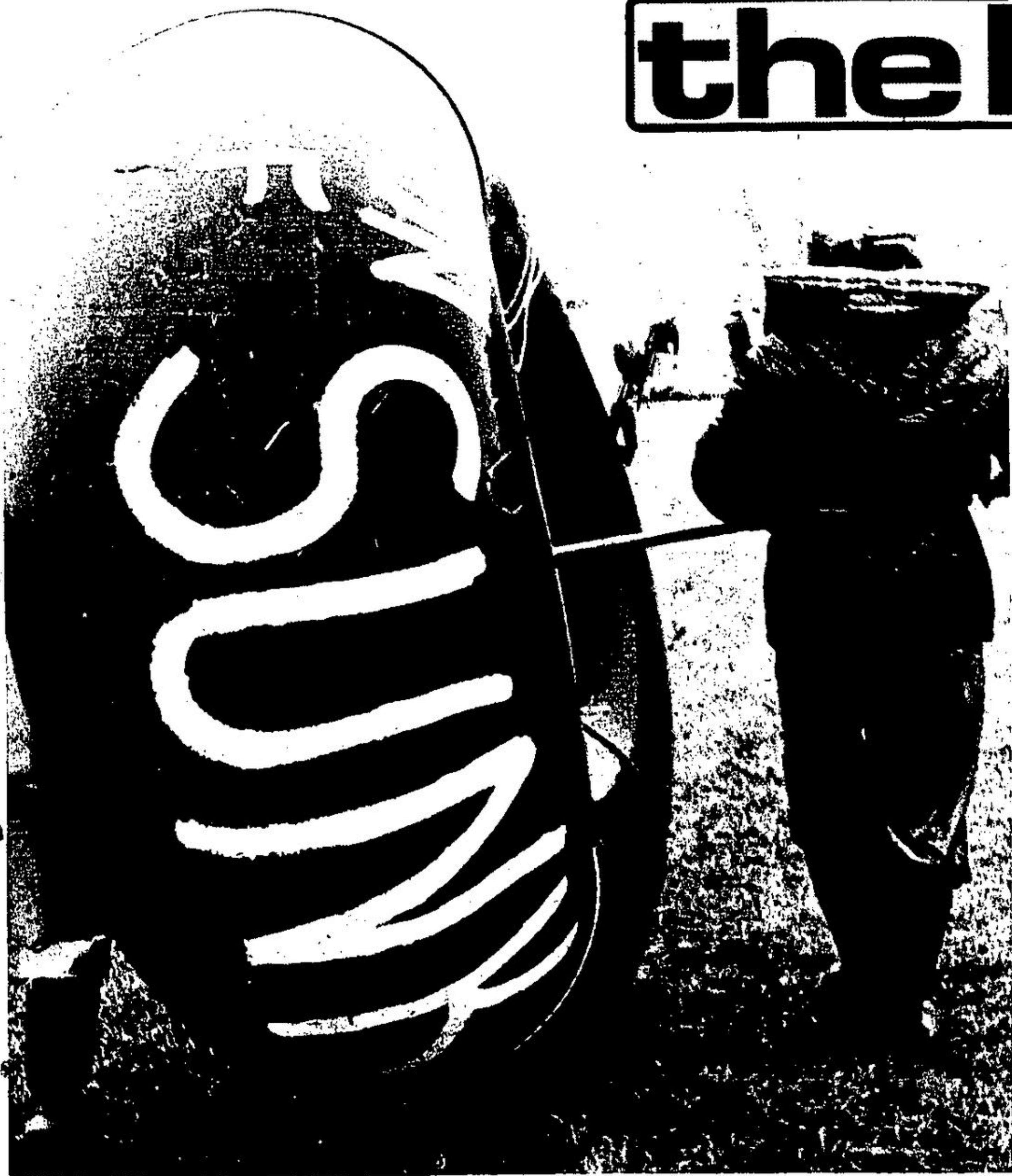
PORTAGING was easy with this entry, it just rolled along.