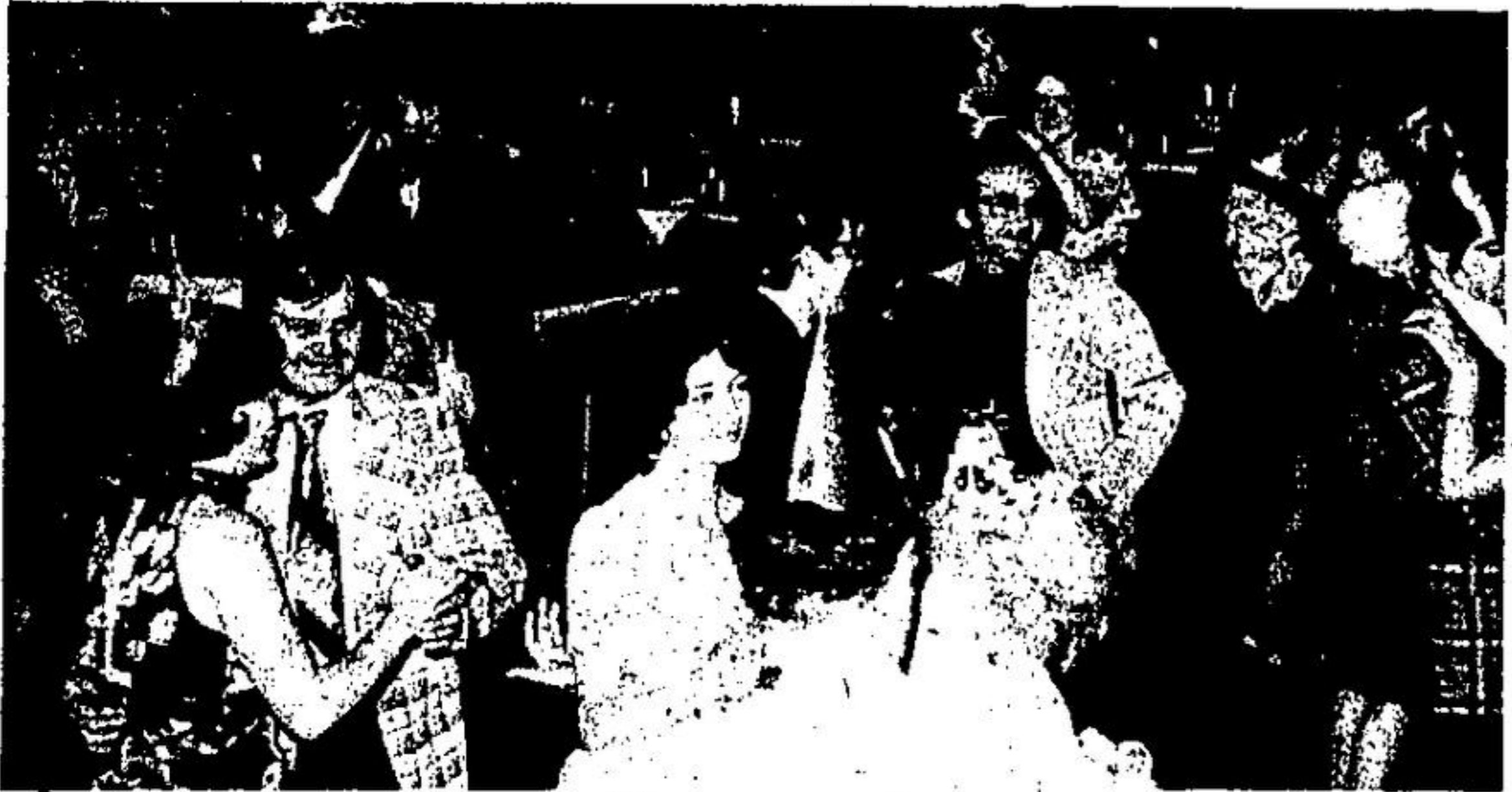
"T'WAS A GREAT DAY for the Irish Saturday night when 75 couples danced 'til one in the morning to the music of the Shayoes in Holy Cross School auditorium. The dance was