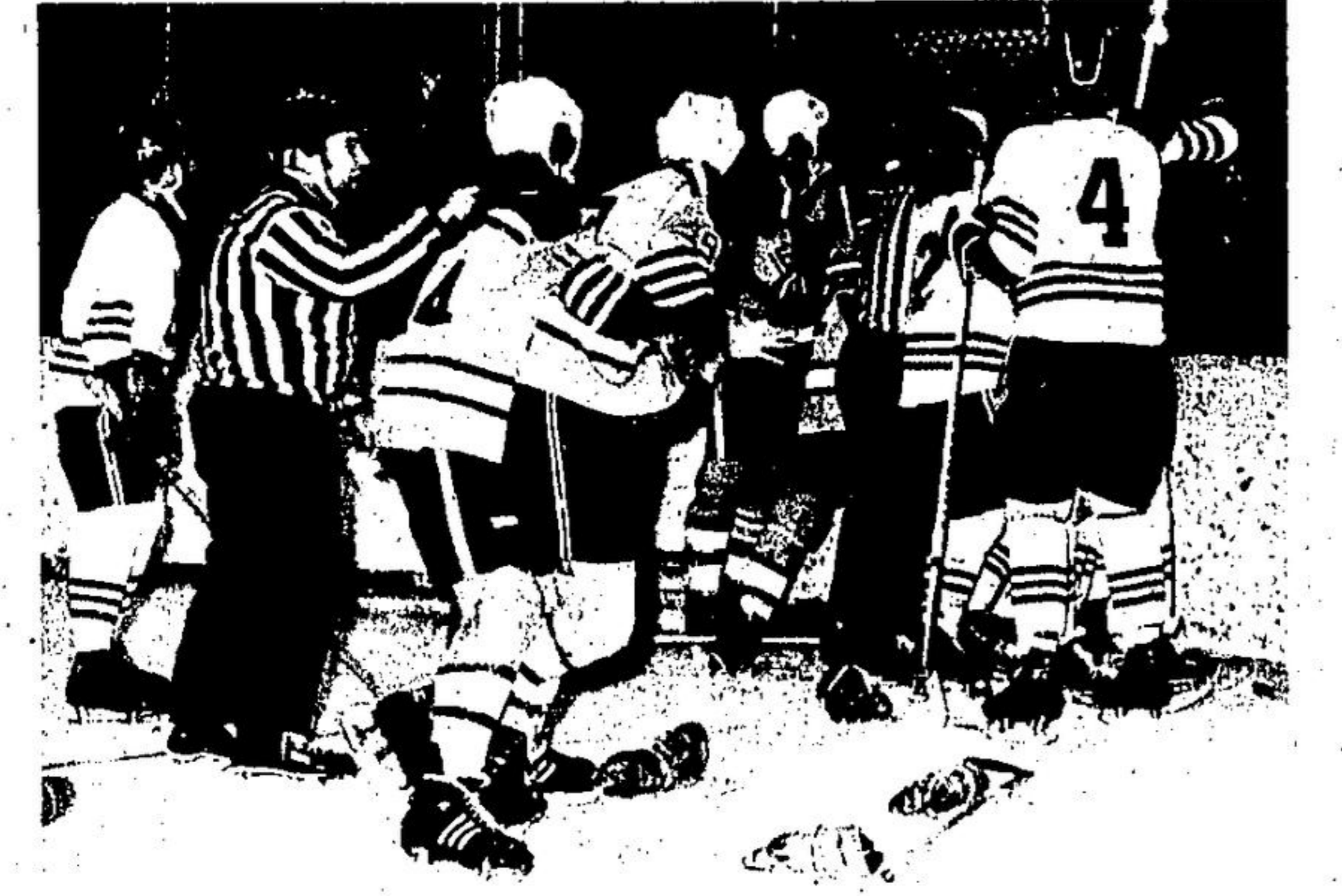
THINGS GOT SLIGHTLY OUT OF HAND in last Thursday's contest between Georgetown's Sunny Acres Major Midgets and Dundas. Georgetown won the game 5-2 and thus advanced to the first round of OMHA playdowns. The flare-up was the result of sheer frustration on the part of the Dundas team.