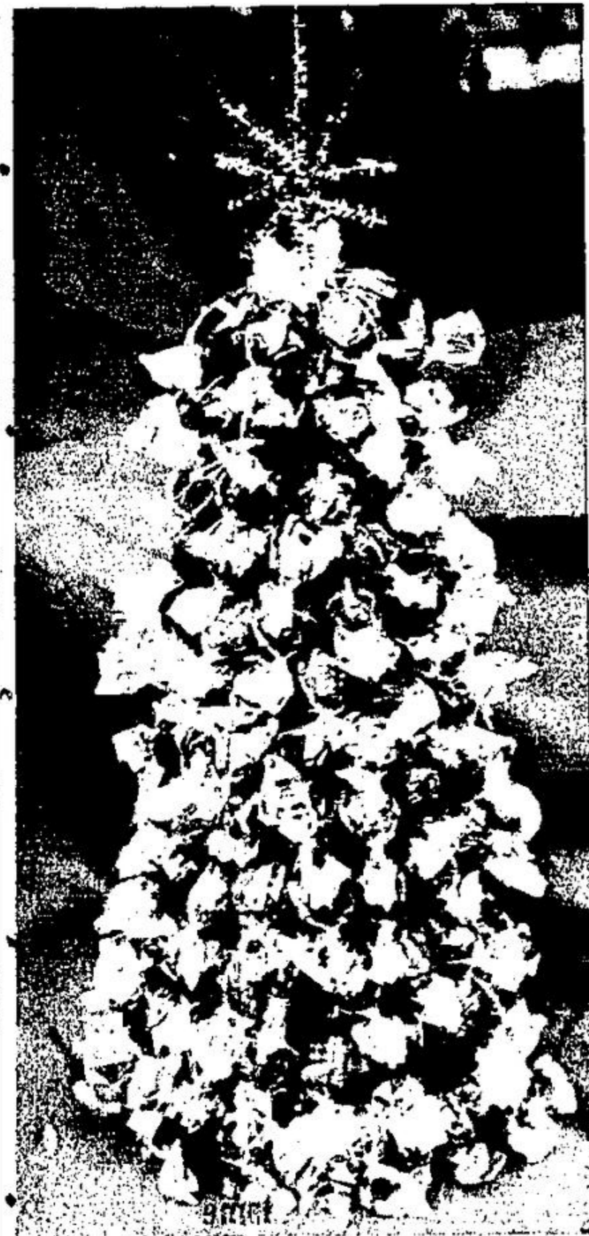
WRAPPED CANDIES pinned to a styrofoam cone gives another variation of a yuletide tree. The star is made from a special kind of unsalted pipe cleaner available at Georgetown Hobbies and Crafts.

But we have a lot of different ornaments made up and when people come in to buy the materials we just show them right here how to do it. Most of it is just imagination. You just do your own thing and no two decorations come out alike." She claims that more and more people are looking for a more personal touch and some people make decorations all year round. "Some women come in here before they go to their cottages for the summer,