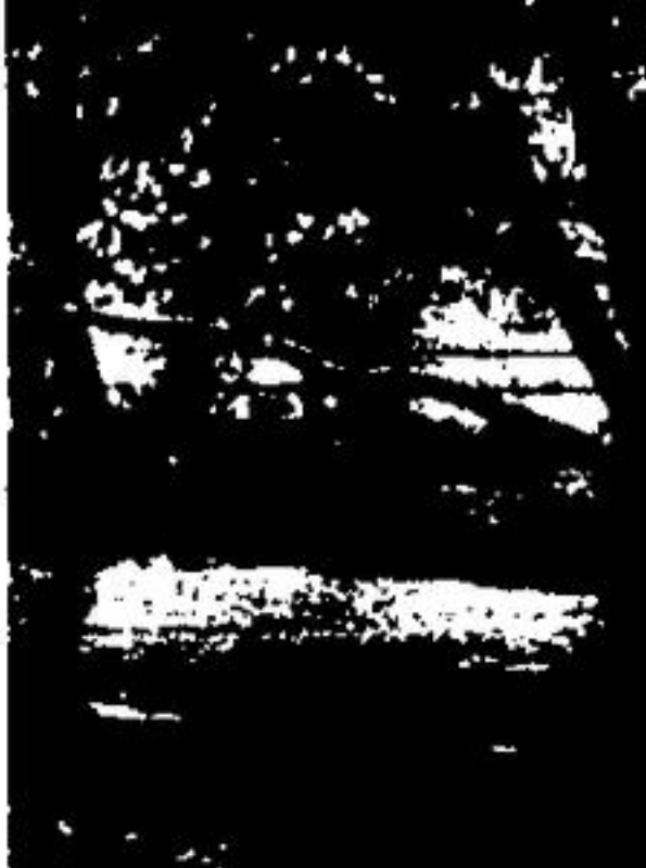
BEAVER RIVER, THORNBUURY

BEAVER RIVER, THORNBUURY This area is open every day except Sunday till November 30 and the limit is two birds per hunter. These are quite often taken in a very short time, and check back in at noon. When all are in at least one bird per hunter registered is released. These are stocked birds that are crossed with tame stock to provide a bird that is very wild and more hardy than the wild stock alone. This makes for a more challenging hunt where