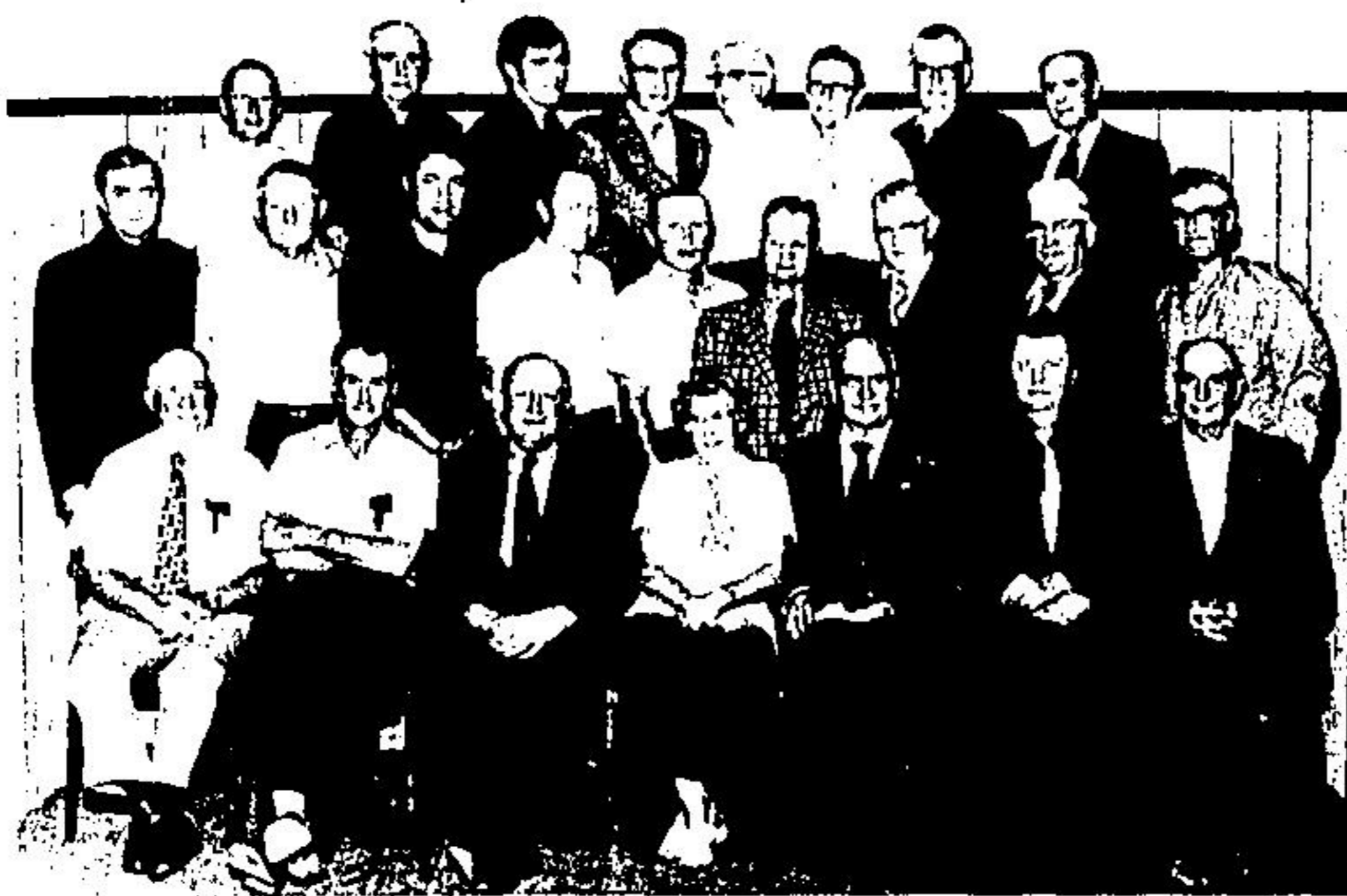
1974 HALTON COMMITTEE MEMBERS responsible for planning and co-ordinating the 61st International Plowing Match