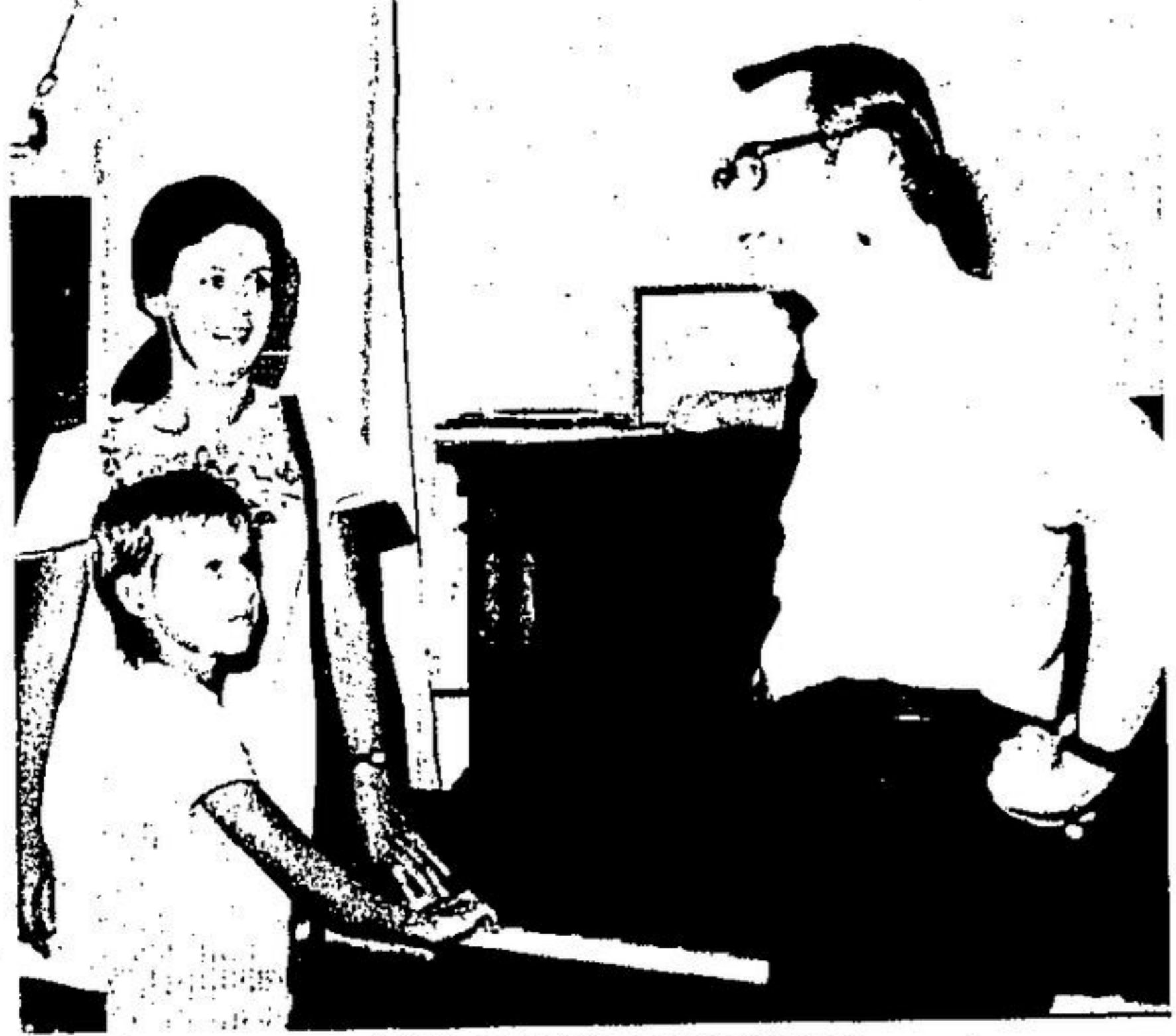
MEET THE TEACHER