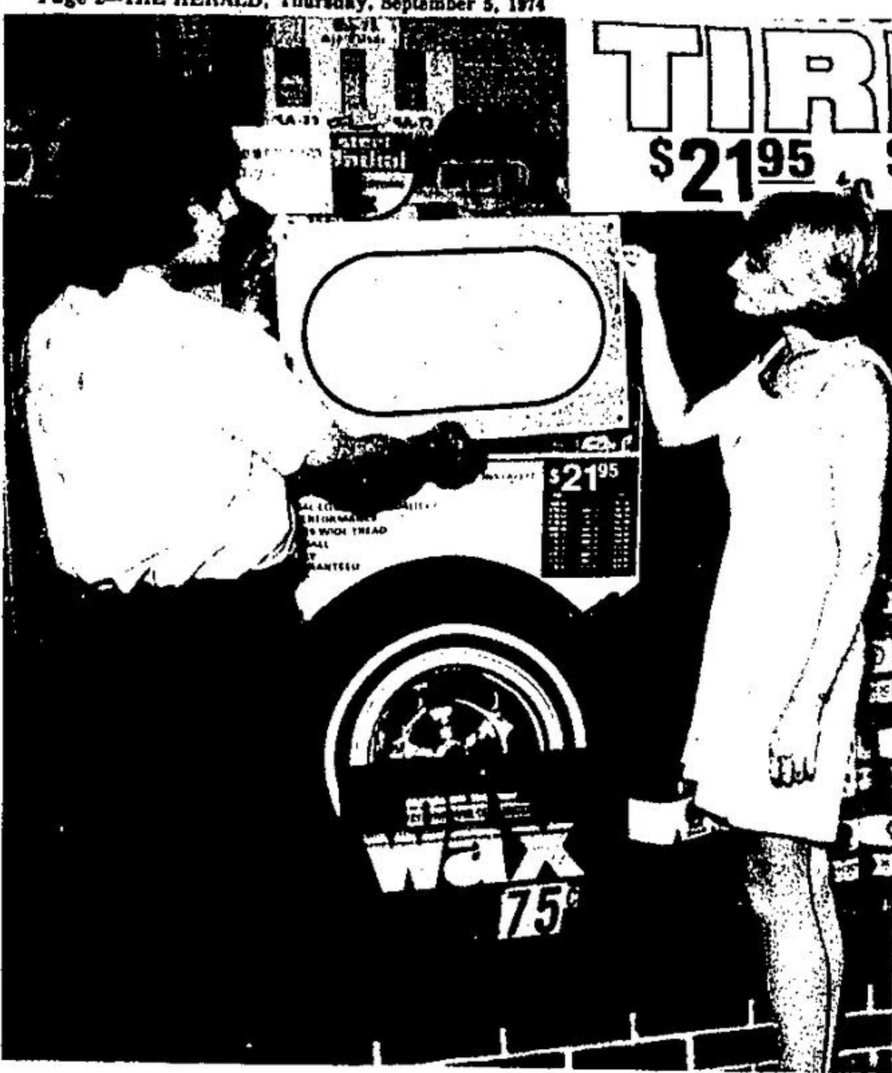
AFTER SEPT. 1 1974, all used vehicles must be inspected at a motor vehicle inspection station prior to the time of sale or transfer. Service stations licensed by the Ontario Ministry of Transportation and Communications to carry out a safety standards certificate inspection will display this sign.