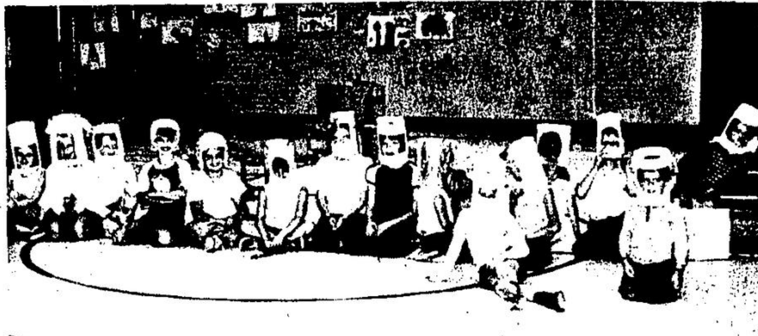
In preparation for their trip to Ontario Place last Friday the Park public school