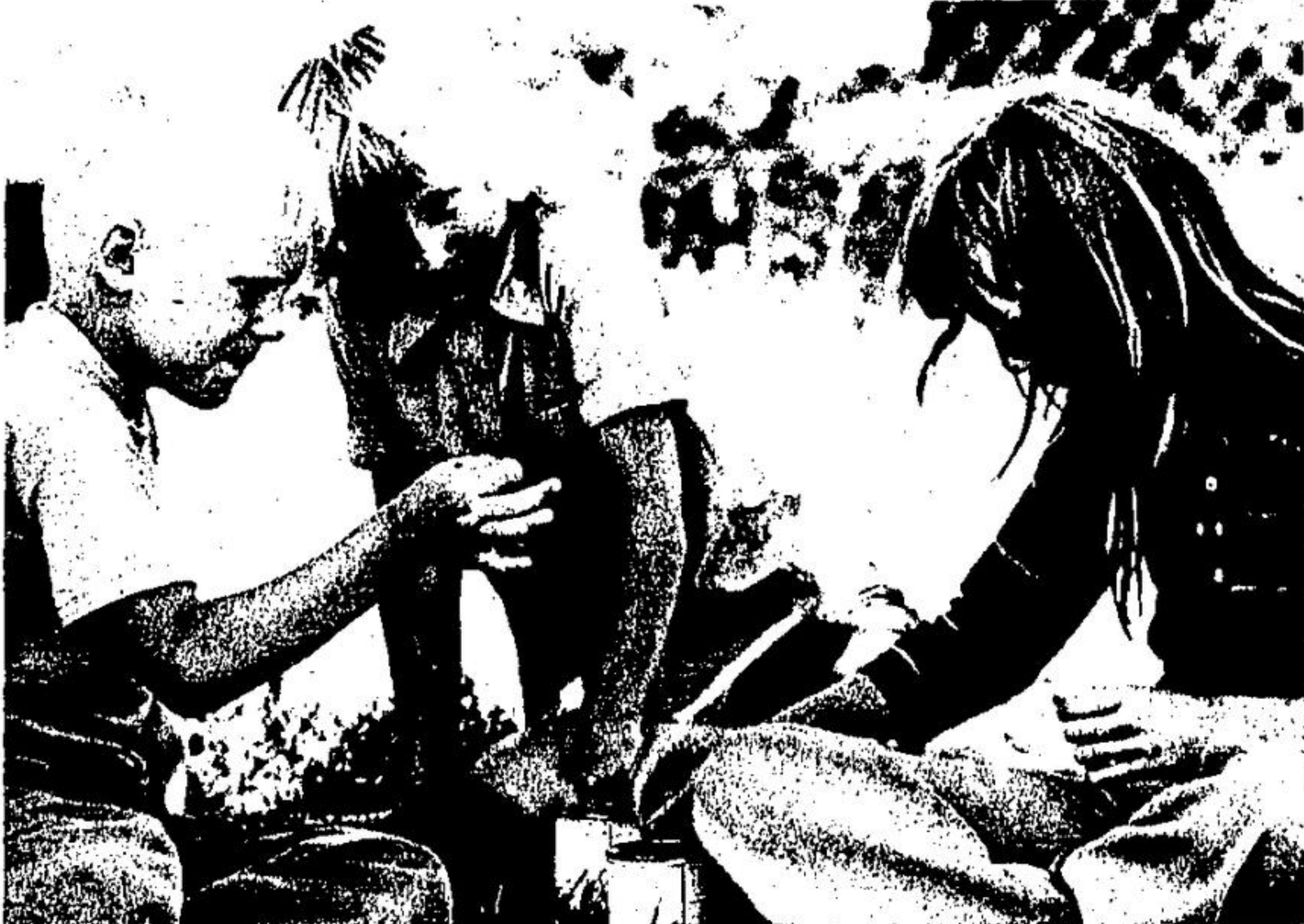
THIS IS THE "dip-it" group. By bending thin wires and immersing them into a special liquid called "dip-it" the children at Harrison