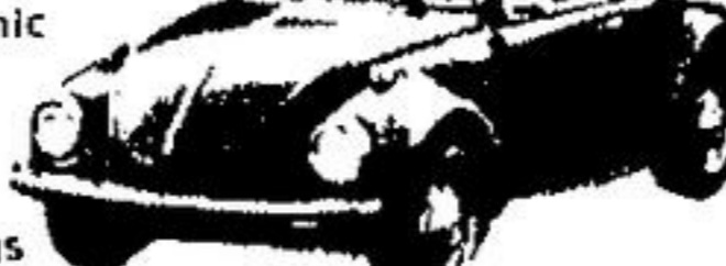
877-4571 572 Main Street, Glen Williams 11

Factory trained mechanic Free courtesy car by appointment Open Saturday mornings 877-4571 572 Main Street, Glen Williams 11