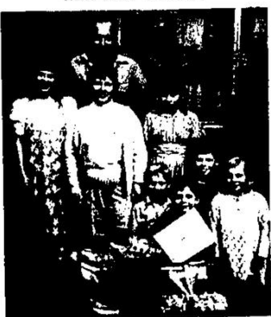
ON WINNING OUR FATHERS DAY PRIZE SPECTACULAR