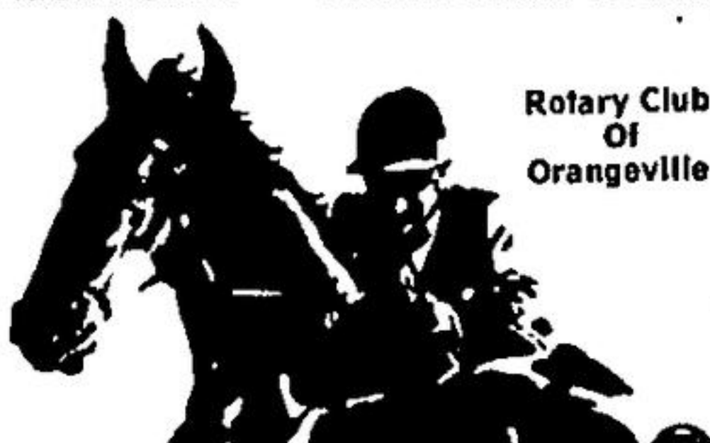
Rotary Club Of Orangeville

TICKETS GOOD FOR TWO DAYS Friday From 9:00 a.m. Saturday From 10:00 a.m. Adults $1.50 14 and Under 75 cents