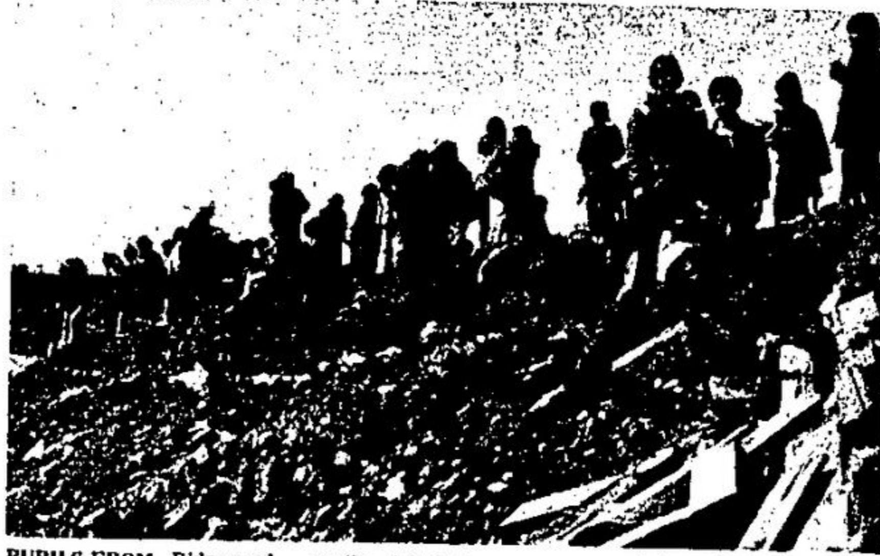
PUPILS FROM Ridgewood Public School in Malton march down into the Halton Hills municipal dump at Georgetown. Two busloads of