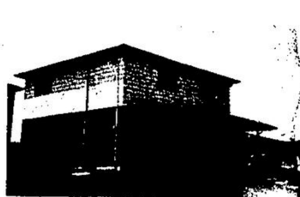
SHOPPING AND SCHOOLS —Close by to this two storey home, featuring large kitchen, separate dining room, four bedrooms, paneled rec room. Lovely home at only $67,500. Call Murray Smith.