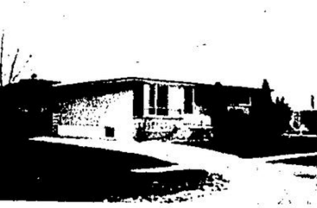
IN QUIET AREA —Is located this lovely three bedroom bungalow. Spend many happy hours of relaxation in the tastefully finished rec room with bar. A real special at $53,900. Call and ask for "Del".