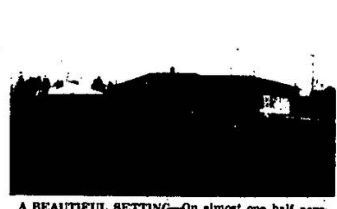
A BEAUTIFUL SETTING —On almost one half acre near Norval. A well built aprawling three bedroom bungalow. Well priced at $68,500. Call Rosemary.