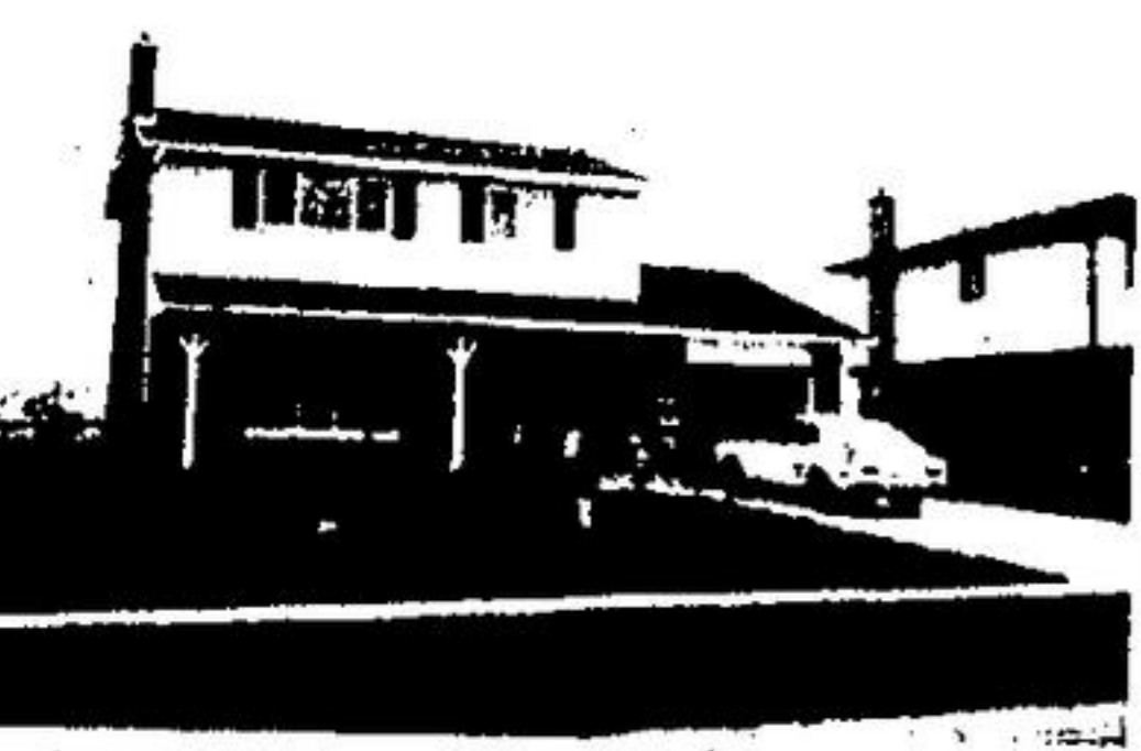
TRADITIONAL TWO STOREY —A seldom found model in Georgetown. Specially built, with four bedrooms, stone fireplace in the living room, main floor family room with a walkout onto your gorgeous ravine lot. Call Flo Matheson for an exclusive appointment to see this lovely home.