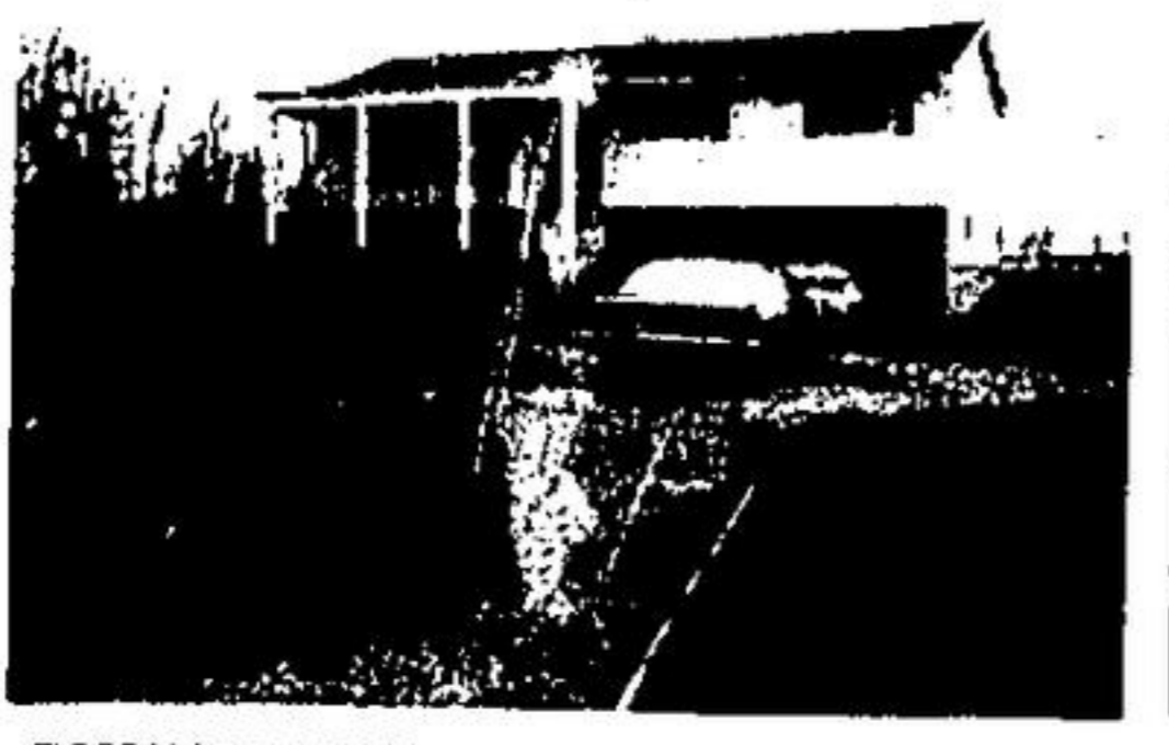
ROMANCE OF LIVING —Is yours in this luxury home in the country. Three bedroom huge living room, broodloom, formal dining room, family room, fireplace, walkout to patio, two bathrooms, two car garage. Beautiful 125' x 328' lot. Ready for your enjoyment, only $84,900. Call Herb Spitzer.