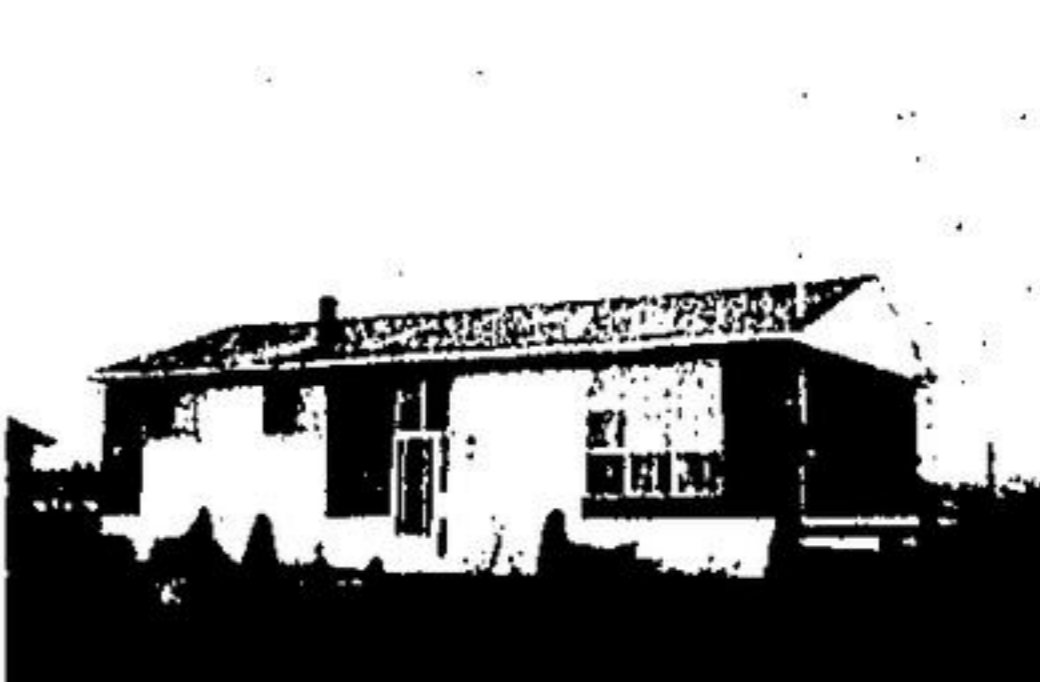
GEORGETOWN'S "GO" TRAIN —Is only 15 minutes away from this three bedroom bungalow in quiet community with interest for all ages. It has extra room in full dry basement, plus recreation room being finished. Spacious living and dining room and kitchen will delight you. Call Alex Glenn now.