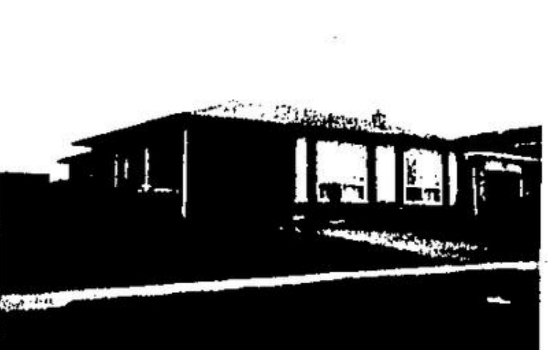
YOU WILL LIKE—This one. A gorgeous three bedroom bungalow on large lot, nicely appointed home with carport in quiet area of town. Close to all shopping and schools. Call Ross Irwin on this one.