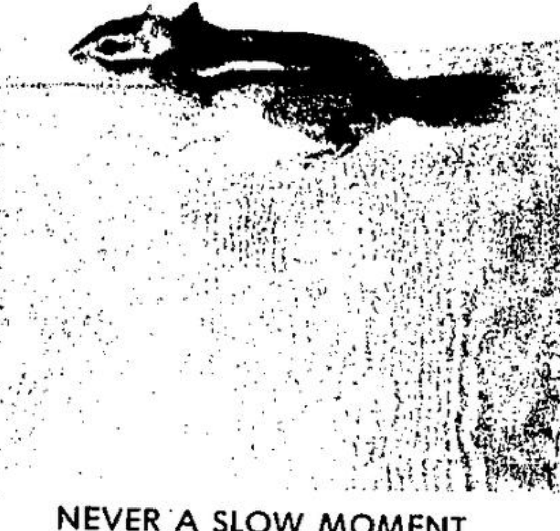
NEVER A SLOW MOMENT