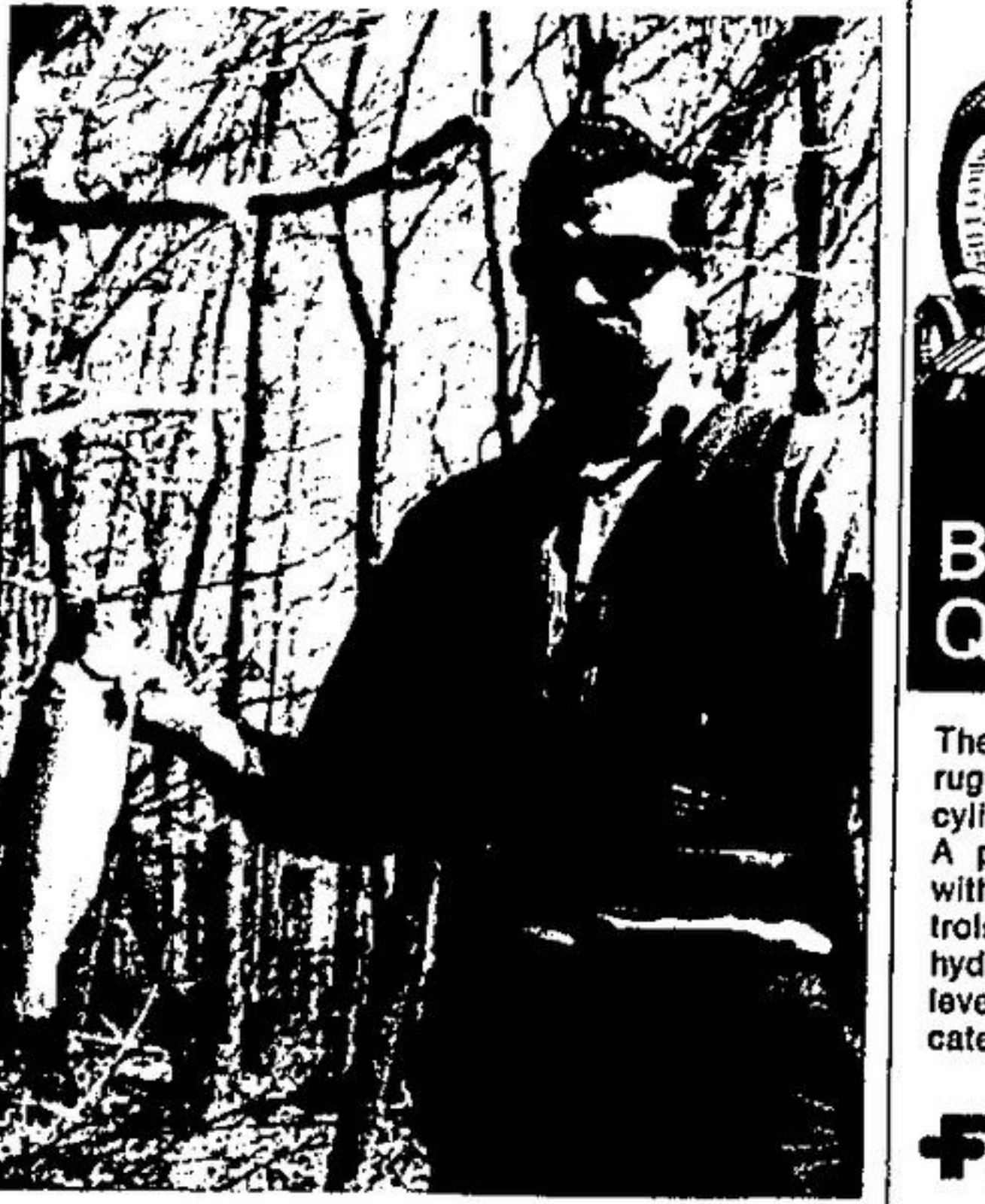
angler's catch will testify. Open season has brought out the fishermen.