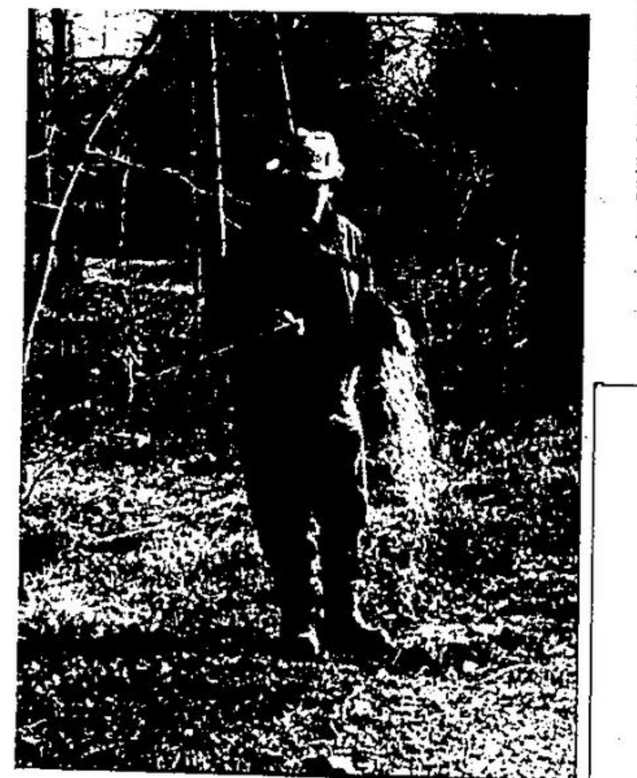
YOU ONLY CATCH fish when your line is in the water, but some time you have to take time to get the snarls out of the line to get it into the water.