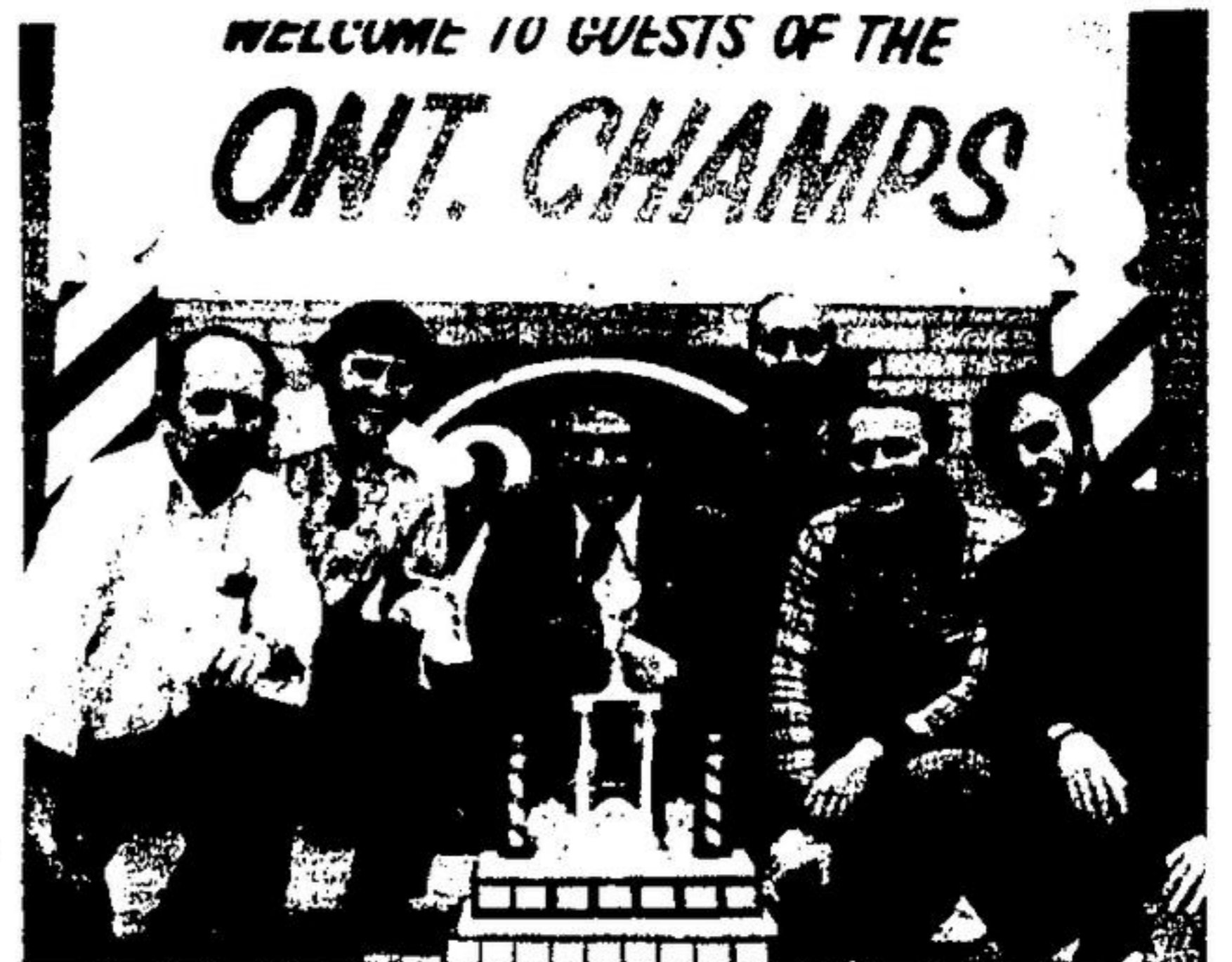
WELCOME TO GUESTS OF THE ONT. CHAMPS

In Georgetown, a special courier service has been launched by Window Express Service.