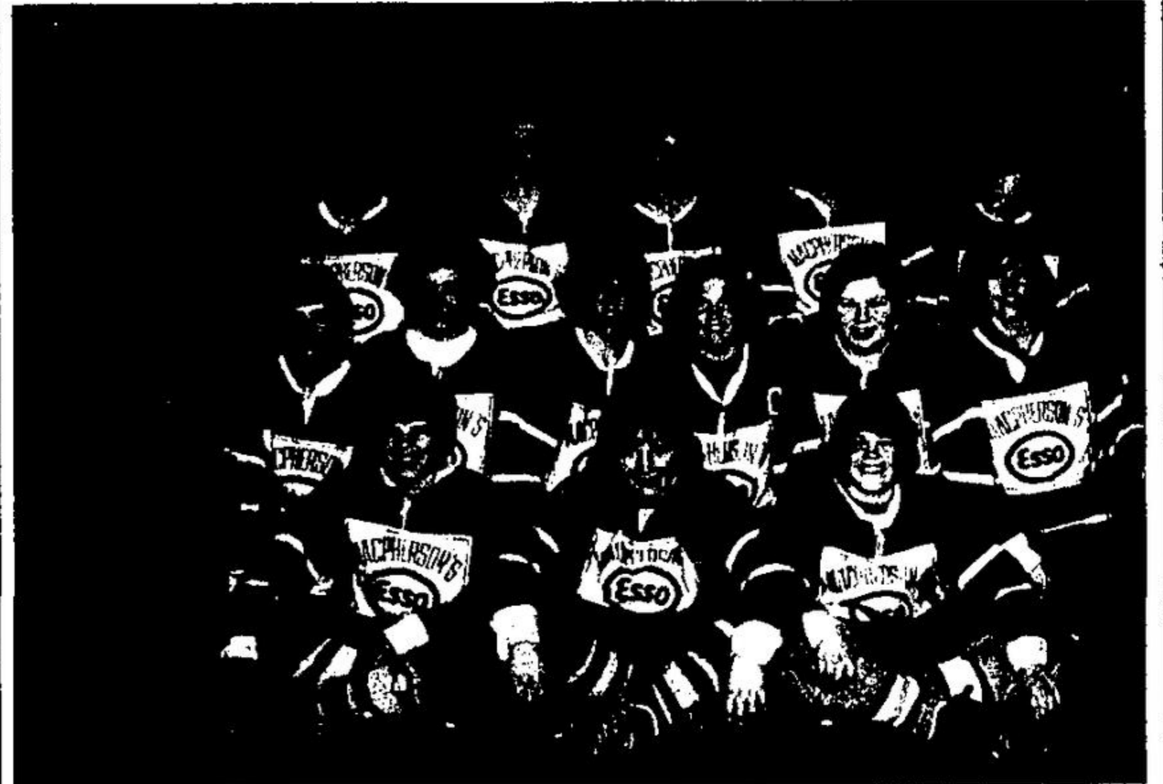
BANTAM HOCKEY CHAMPIONS (House League)