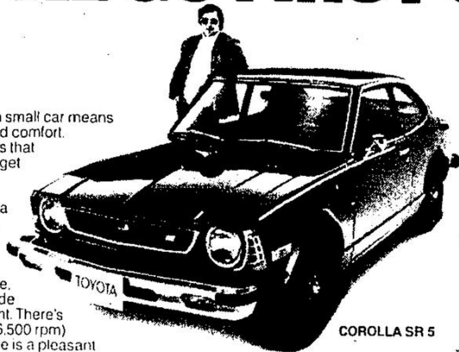
COROLLA SR 5

But even with all its expensive extras, the Corona still isn't what you'd call expensive.