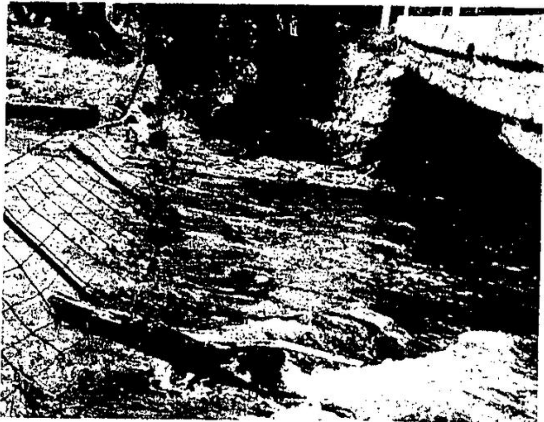
SPRING IS HERE