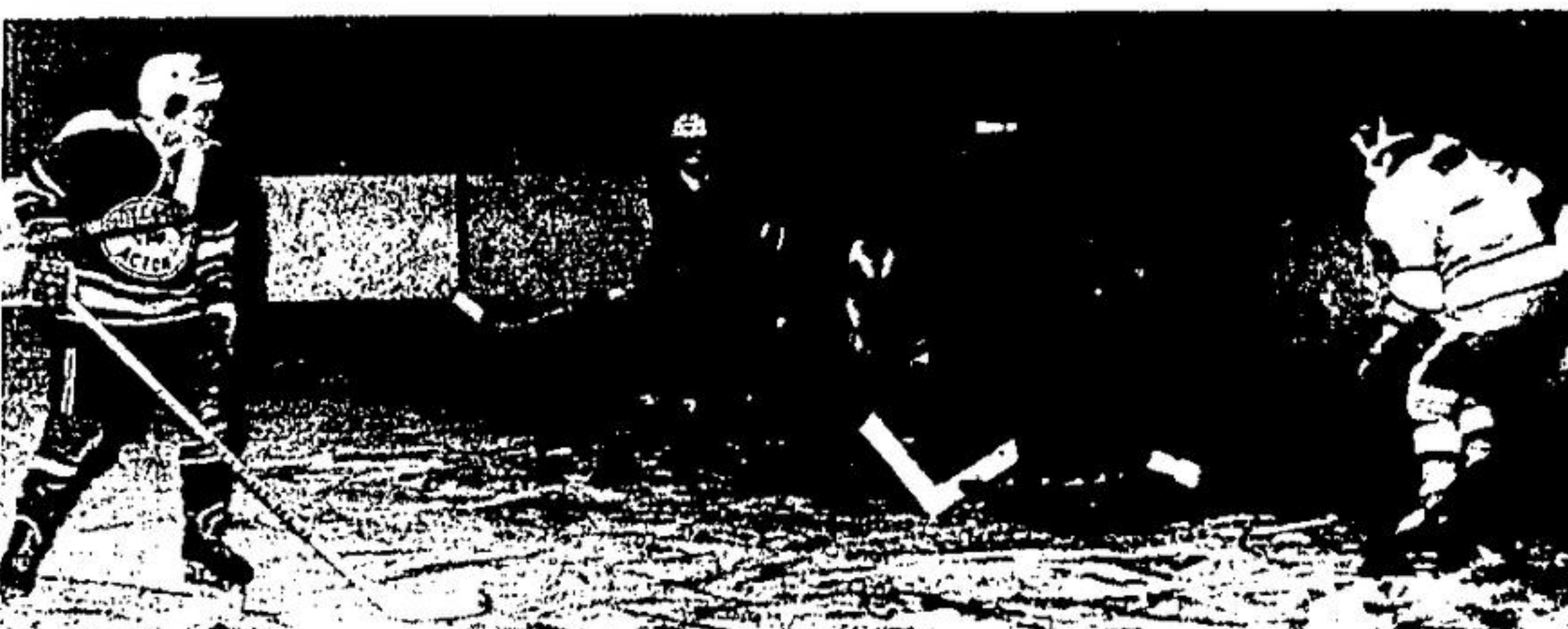
A GEORGETOWN PEEWEE TAKES A SHOT AT THE ACTON GOALIE

STORY AND MORE PICTURES IN FIRST SECTION