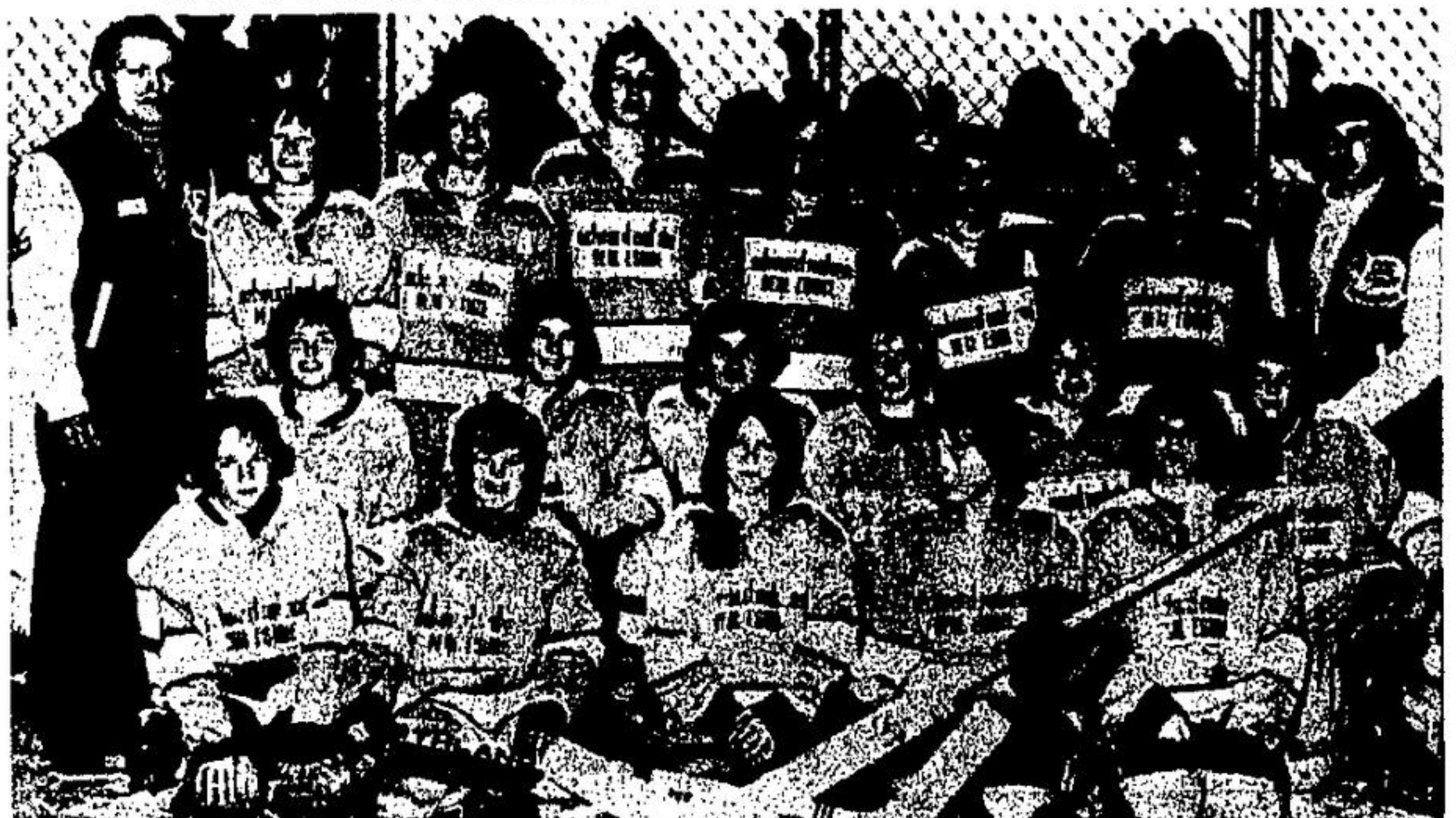
GEORGETOWN PEEWEE TEAM FOUGHT HARD FOR CONSOLATION

STORY AND MORE PICTURES IN FIRST SECTION