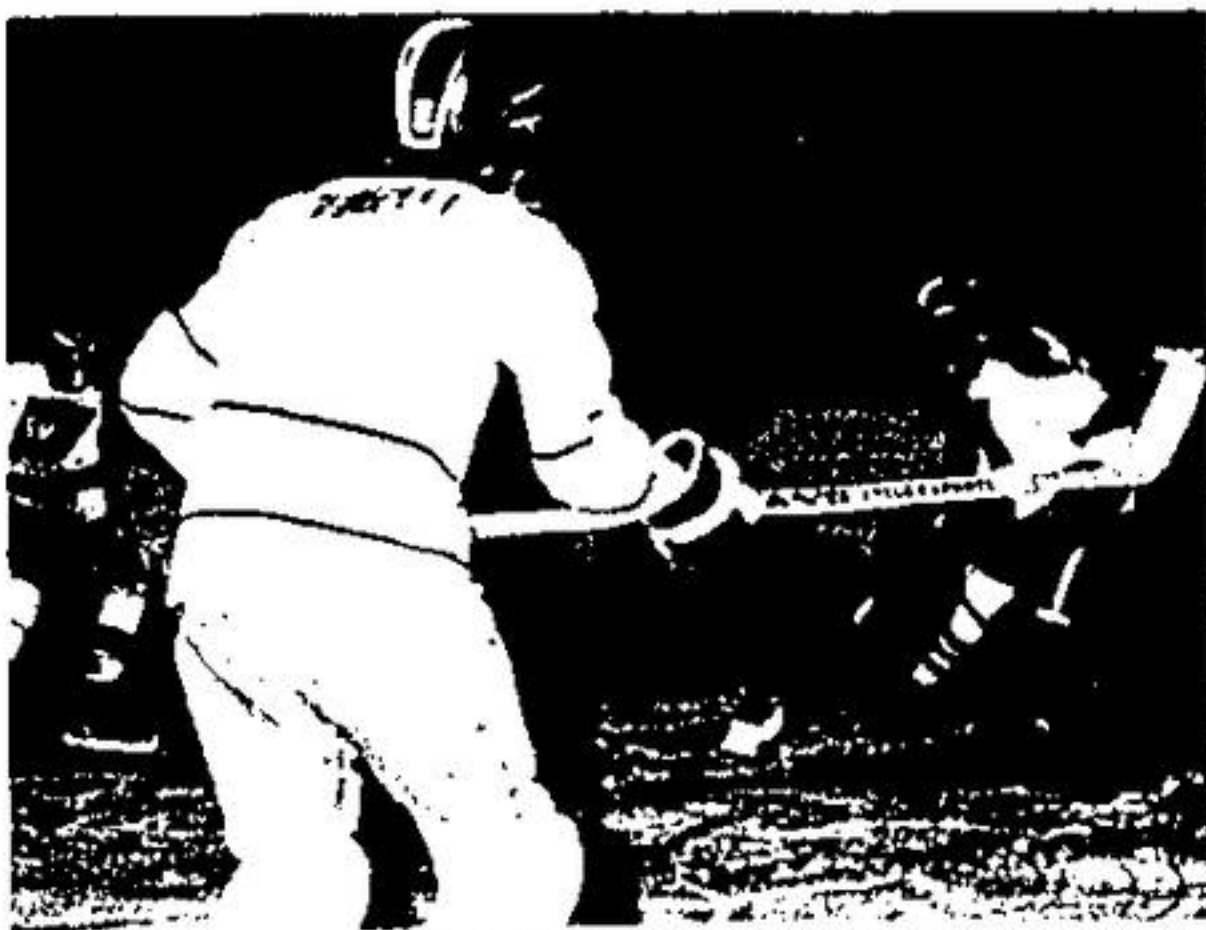
STREETSVILLE GOALIE MISSES ONE