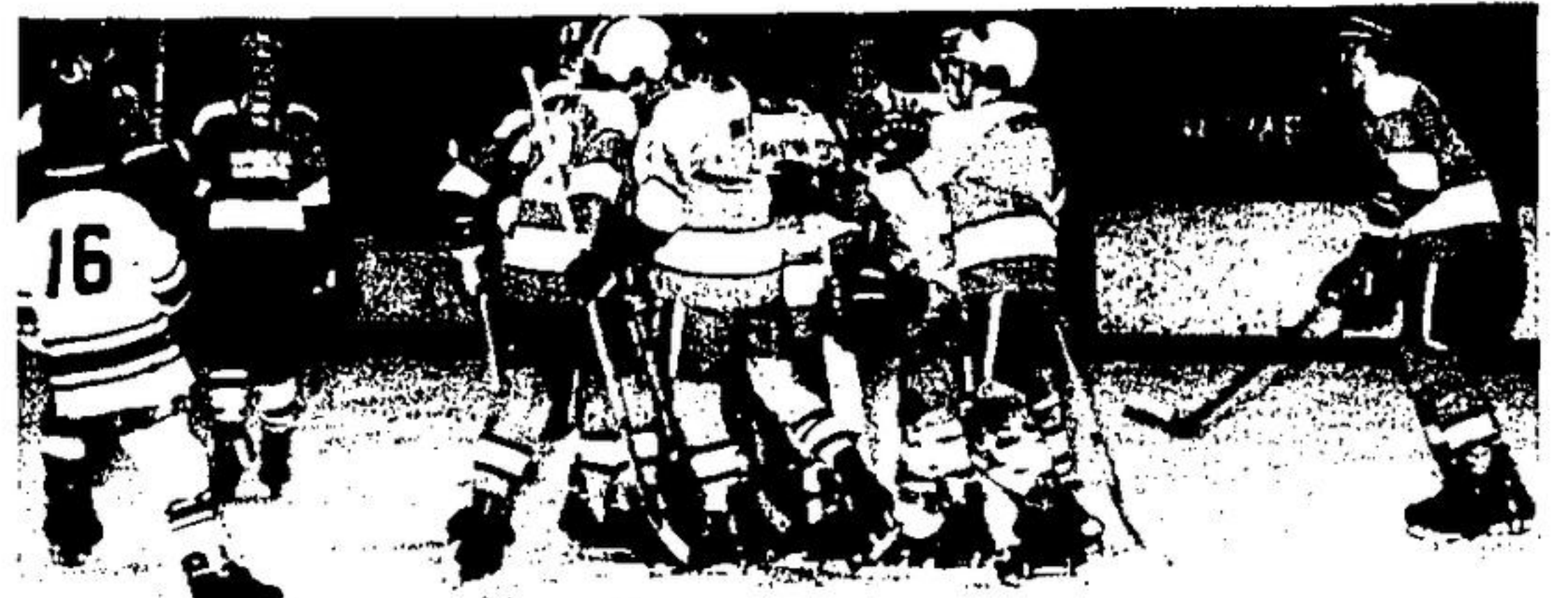
HAPPY GOALIE IS SURROUNDED BY GEORGETOWN PEEWEES