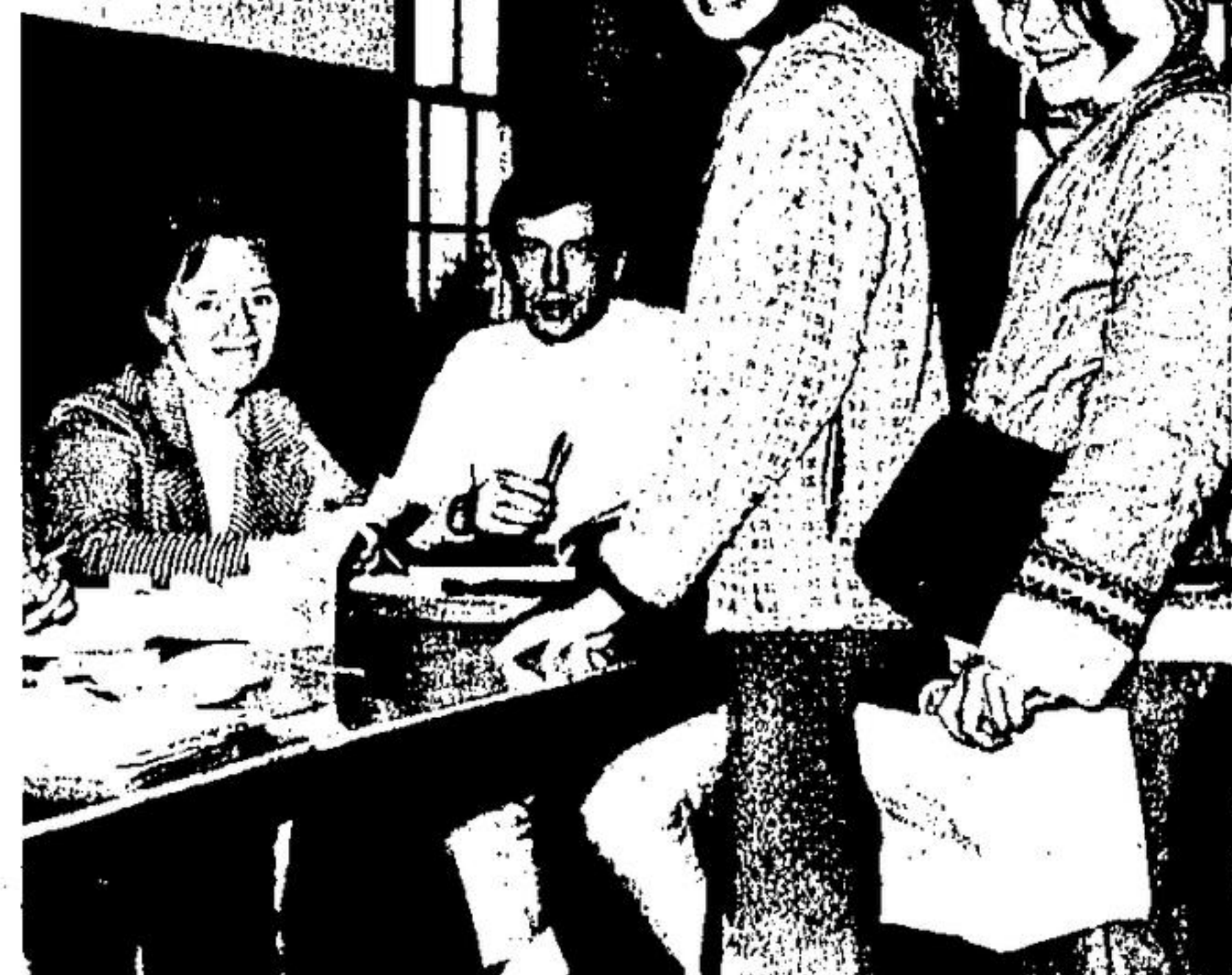
GIRLS SIGN UP