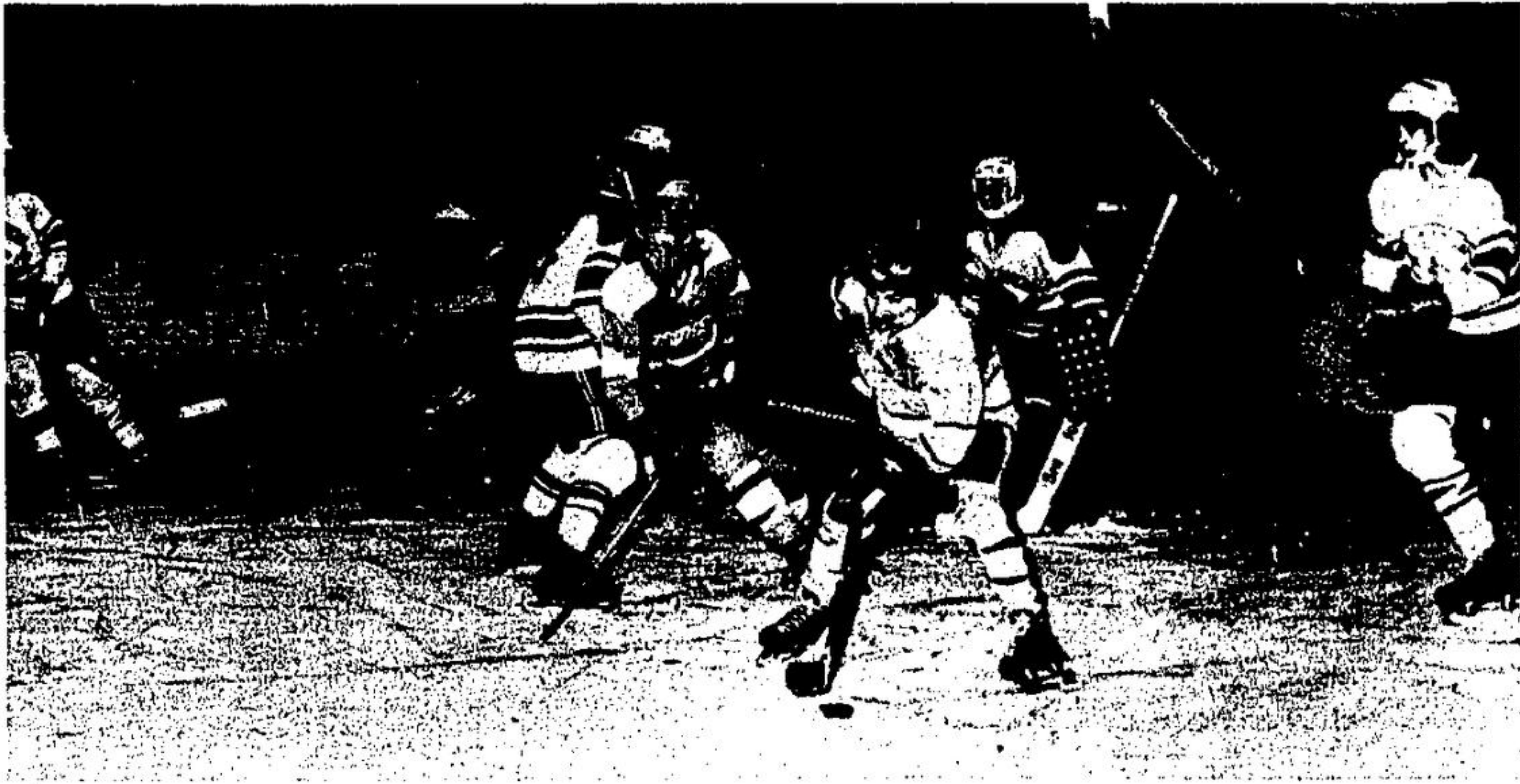
GEORGETOWN ATOMS LOST THE CHAMPIONSHIP AFTER SHOTS ON GOAL