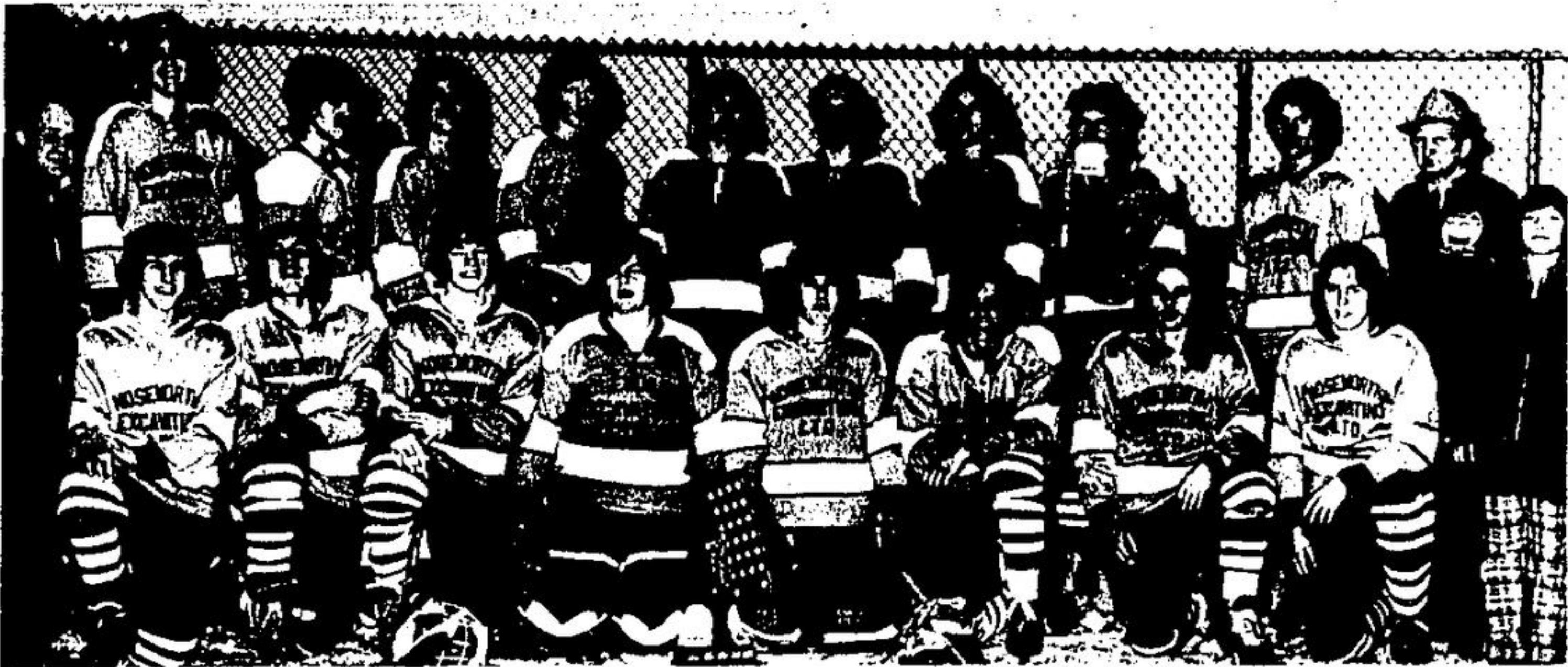
OVERPOWERING GEORGETOWN MIDGETS BEAT ORANGEVILLE FOR THE TROPHY, 8-0