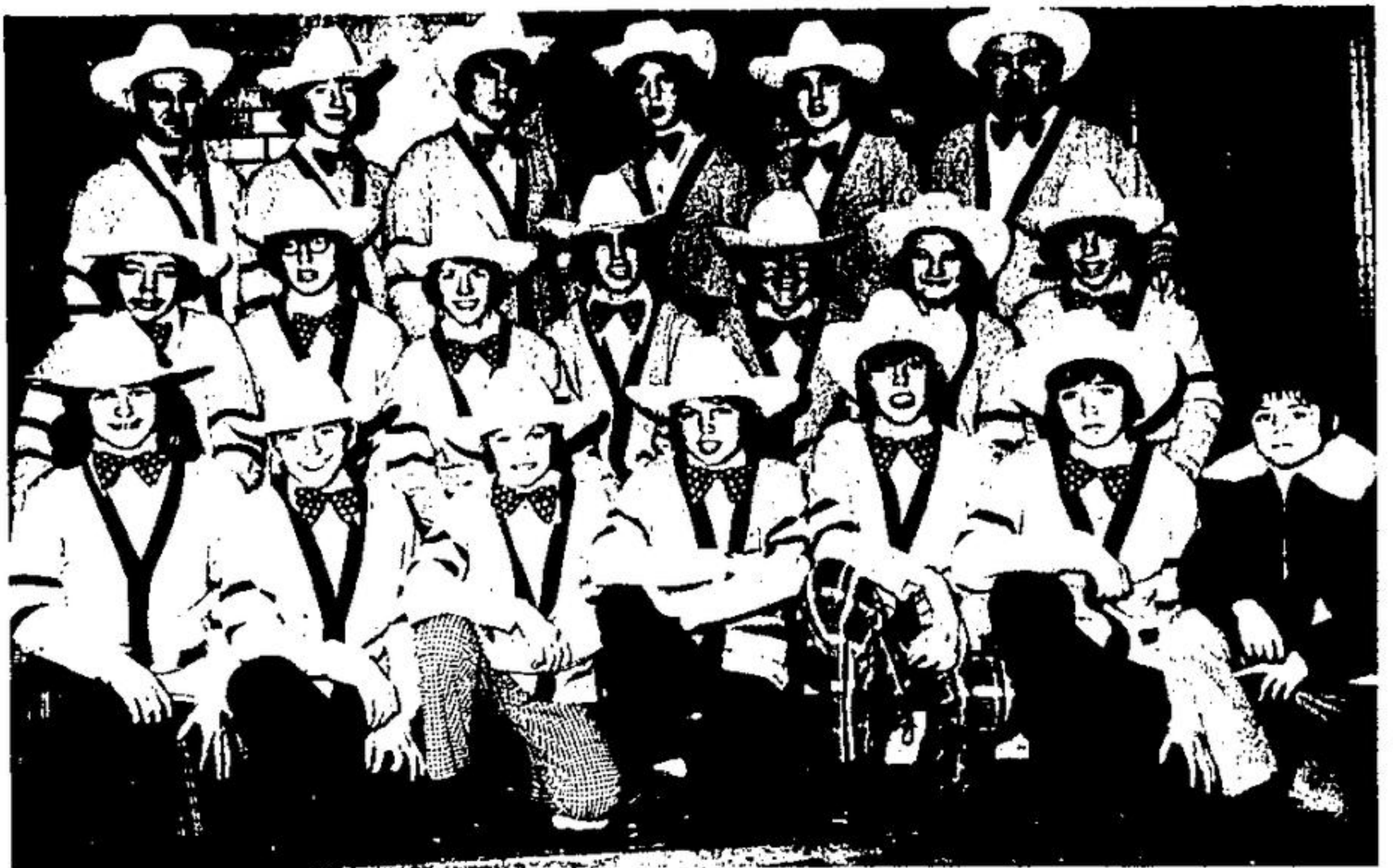
GEORGETOWN BANTAMS TAKE BEST DRESSED AWARD AND CHAMPIONSHIP, 5-1