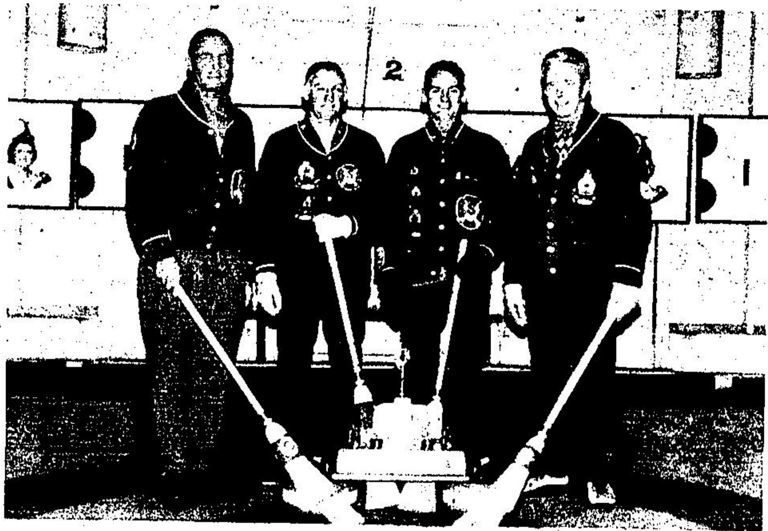
WINNERS OF DISTRICT 'E'