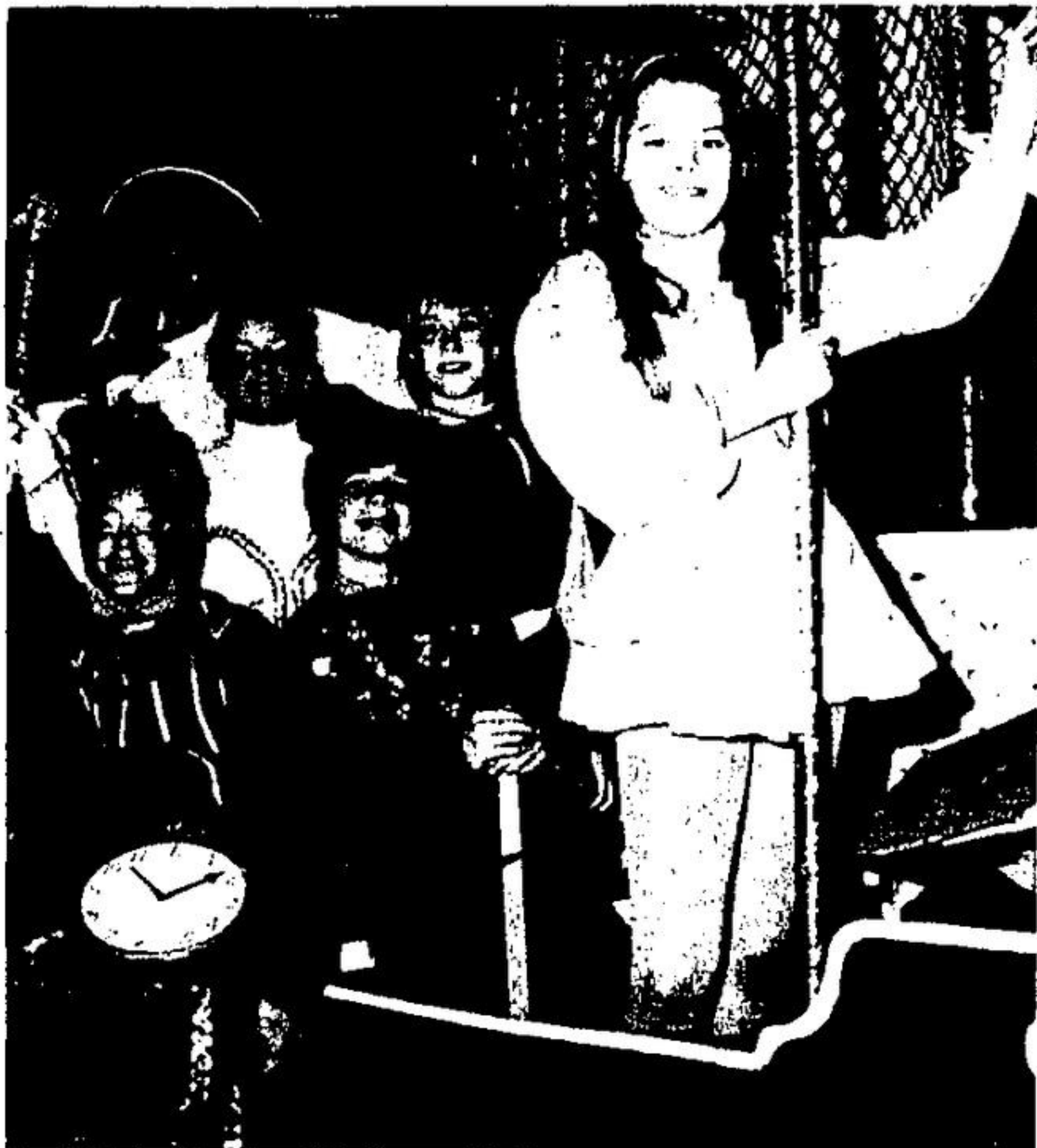
WENDY, PETER PAN AND COMPANY