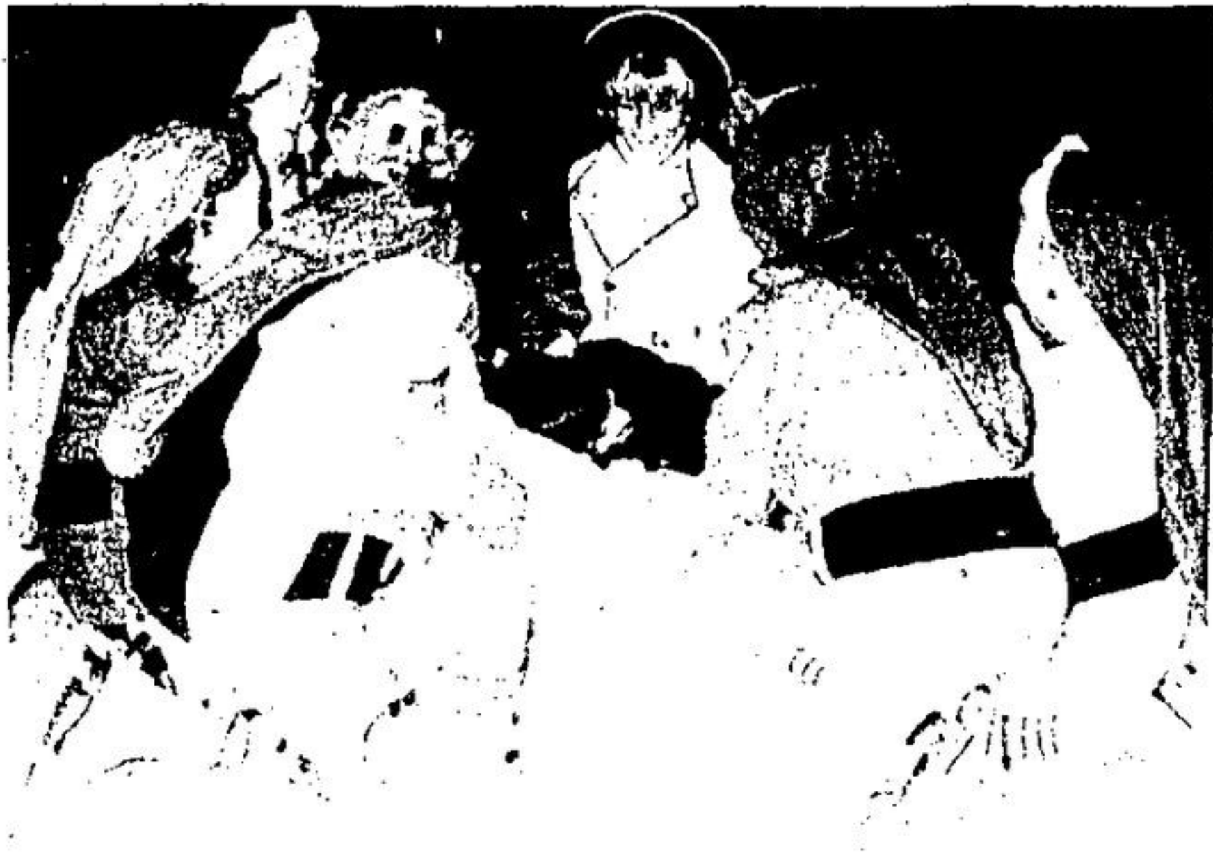
PRINCE CHARMING AWAKENS SNOW WHITE