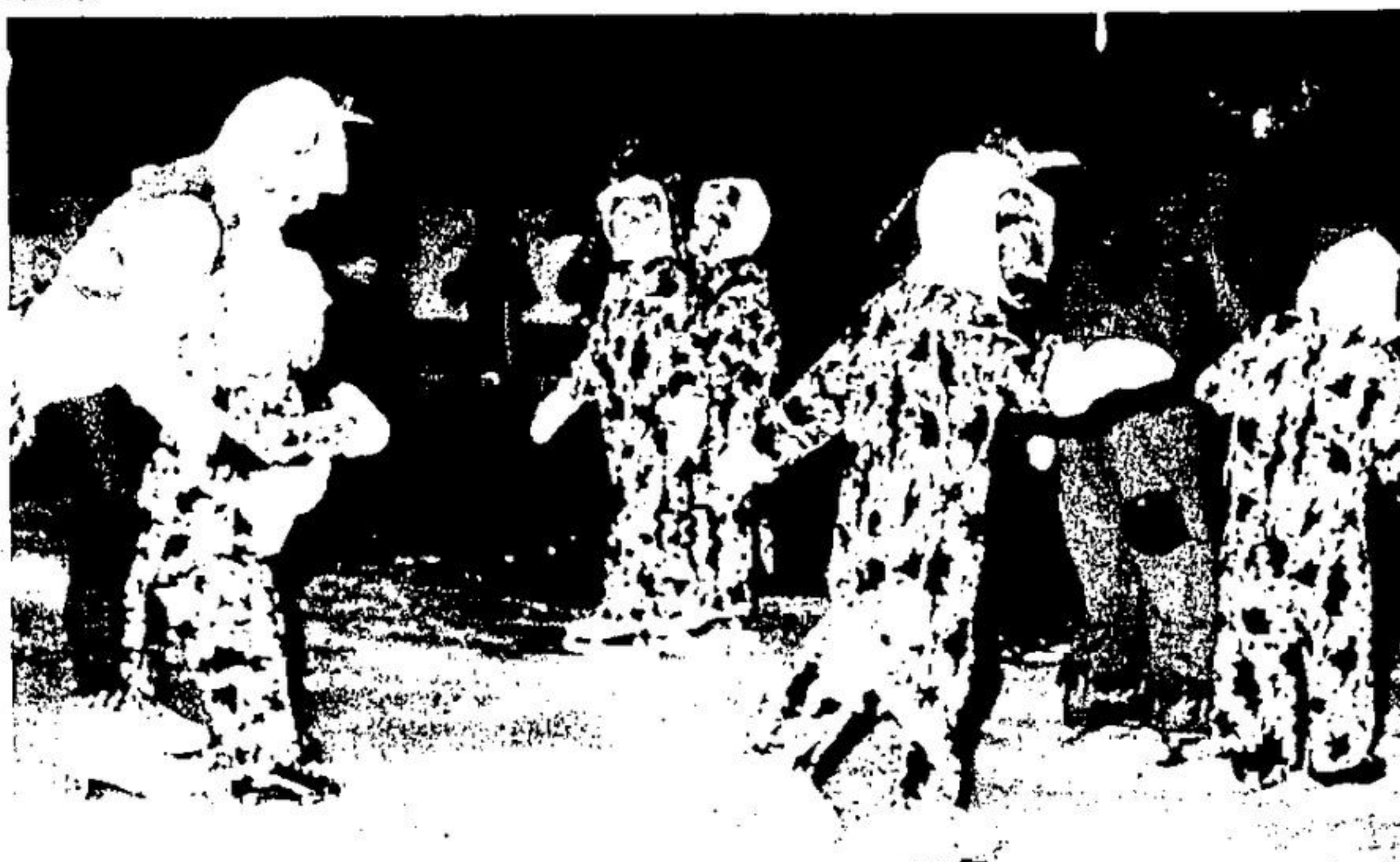
PRE-SCHOOL SKATERS ARE ASSORTED DOGS OF LADY AND THE TRAMP