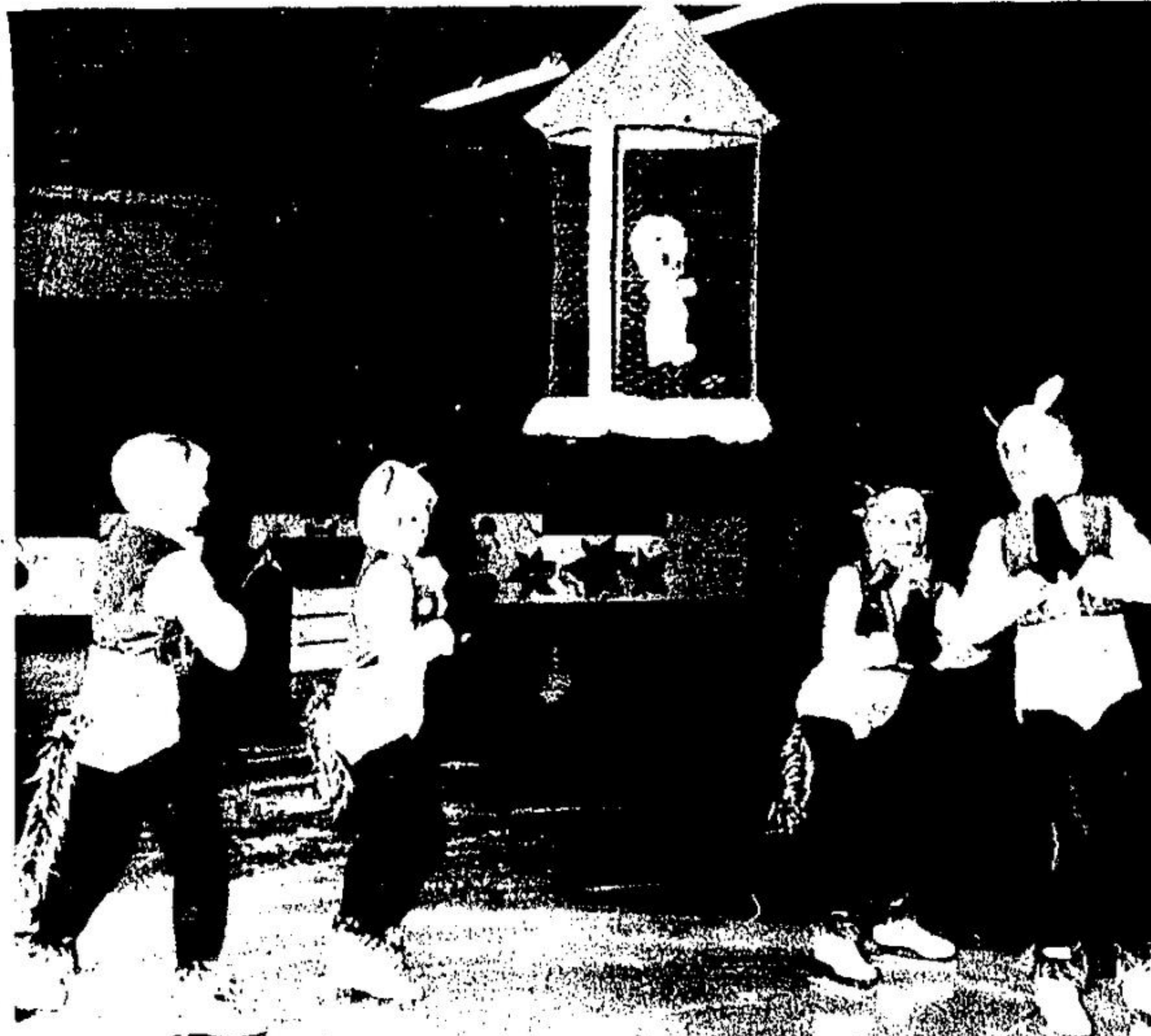
SIAMESE CATS CAST EYES ON BIRD IN A GILDED CAGE