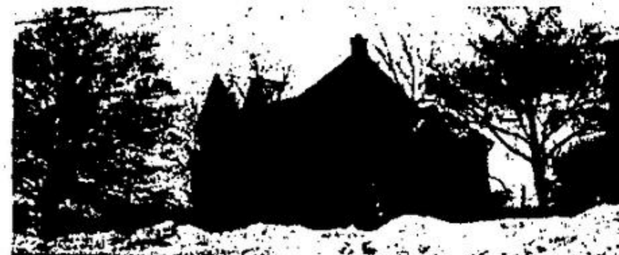
$400. A MONTH PLUS

TRAFFALGAR ROAD Big rolling 10 acres—High knoll for classy home site. Ten minutes from Georgetown—Can't beat this, try $39,900.