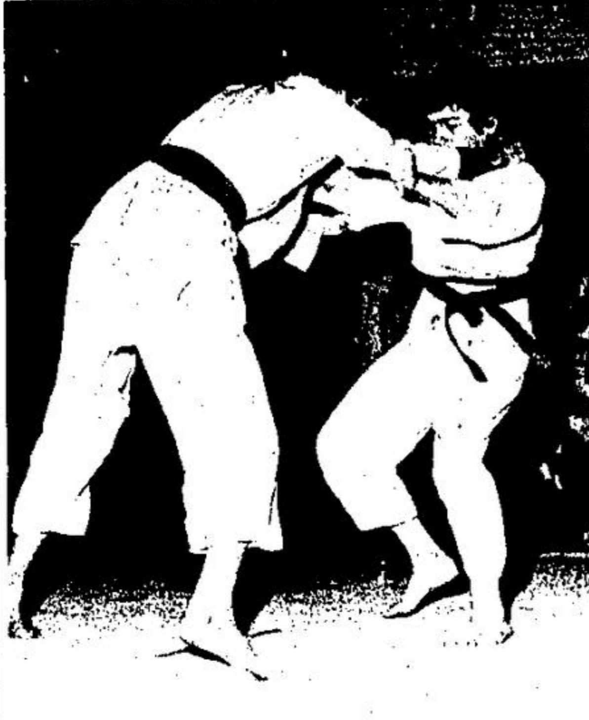
SIZING UP THE OPPOSITION