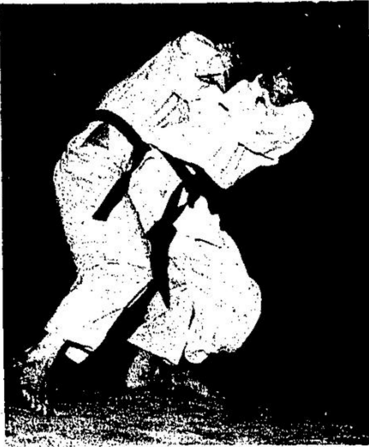
BIG TRY FOR A BIG TOSS