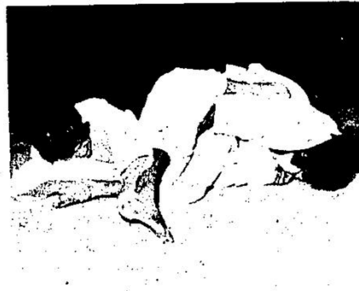
ON THE MAT TRYING FOR PIN