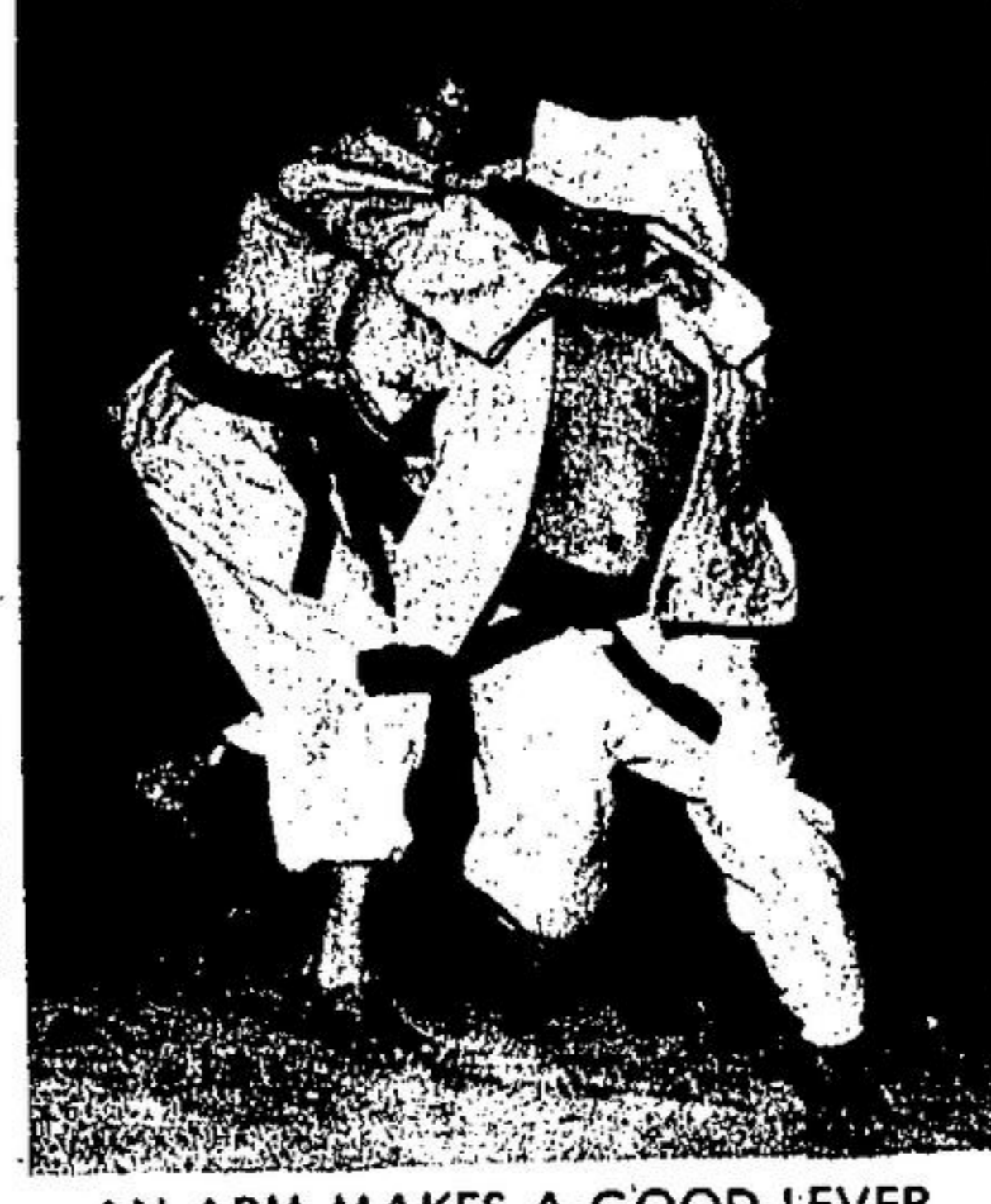
AN ARM MAKES A GOOD LEVER