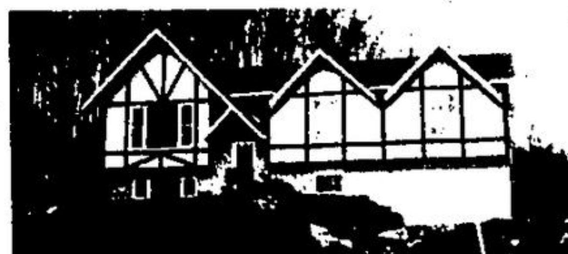
ATTRACTIVE? —You should see the interior! Open style living and dining rooms. Beam and brick fireplace in family room, three bedrooms plus den. Exceptional one acre wooded setting. Builder's price $34,900. Got the picture! Call Bill Ellis.

$48,900 —Seventeen rooms, ideal home for large family; one three bedroom apt., and a six bedroom apartment.