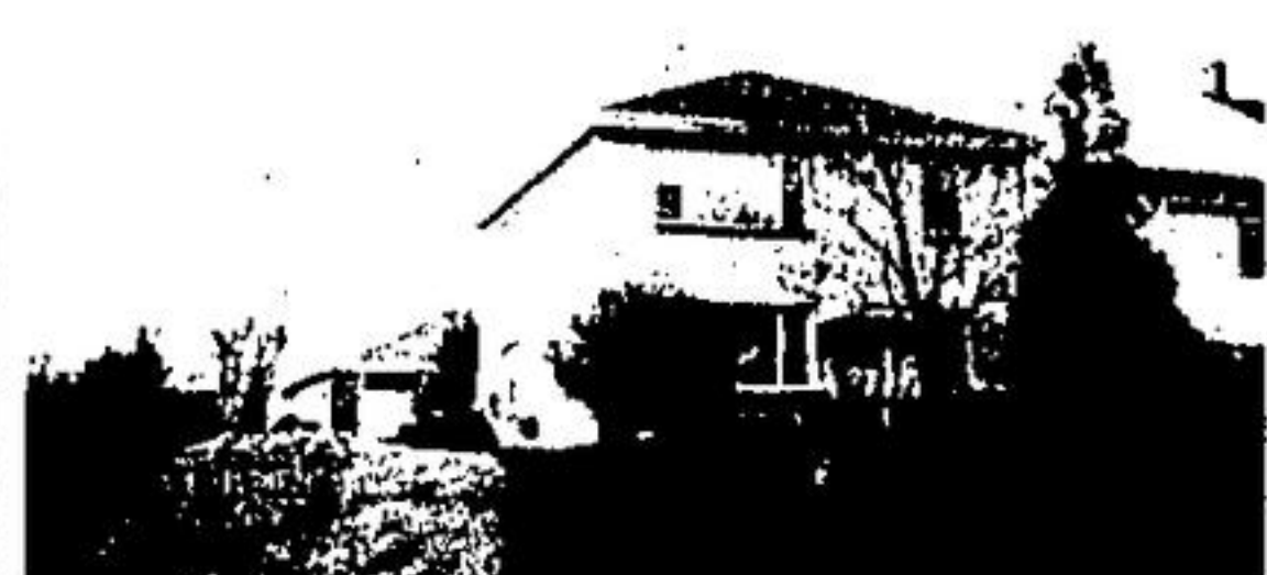
TIRED OF RENTING? —Become the landlord, live in one half of this trim duplex while the other apartment and separate 21'x21' building carry most of the expenses. Situated close to the GO station. Call Larry for details.