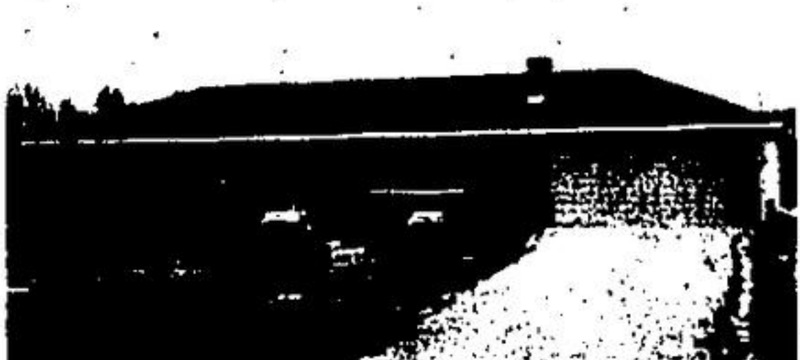
COUNTRY RANCHER —New three bedroom brick and aluminum with attached two car garage, two piece bath in master, five piece and vanity, formal dining and living room, stone fireplace, and huge kitchen. Lot is 125 x 200 over looking gracious rolling country side. Immediate possession. Asking $44,900. Call Herb.