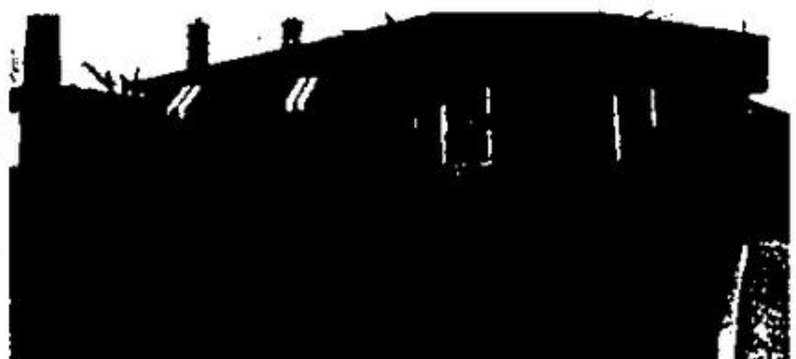
MOVE IN BY CHRISTMAS —Three bedroom brick bungalow on lovely tree lot with paved drive and detached garage. Home is well preserved with broadloom, large living room, kitchen with stove and fridge. Good financing. Call Murray Smith.

$51,000 —The ideal income property, five apartments. Invest your money and make yourself more money now!