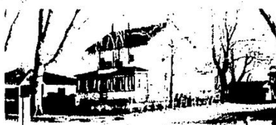
LET SOMEONE ELSE PAY THE BILLS —While you become a property owner. This duplex, situated within walking distance of GO train, is a natural. Also possibility of an extra lot. Asking price $35,900. Call 877-5261 and ask for Del.