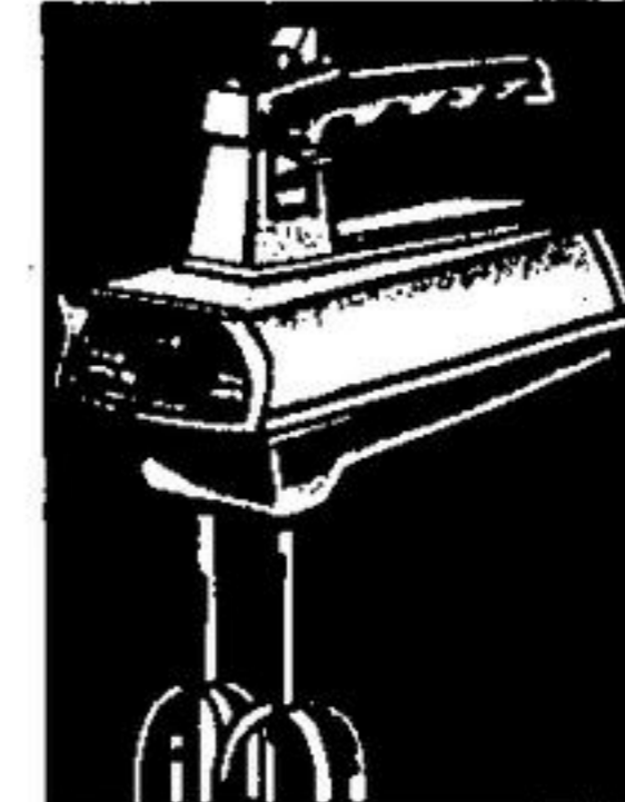
Sunbeam hand Mixmaster