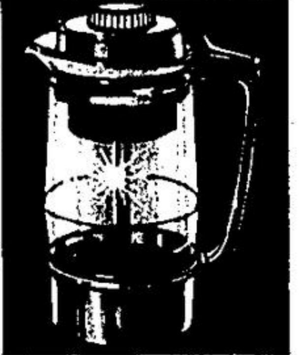
Proctor-Silex electric Perc.

Handle comes off for easy cleaning. Wall mountable. Avocado or Harvest Gold.