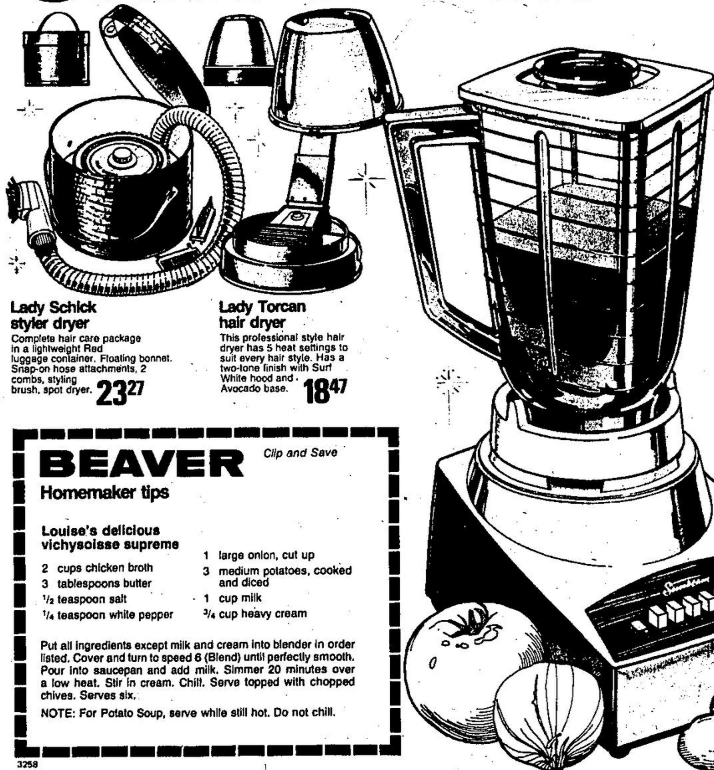
Sunbeam 7-speed blender

Here's one of the handiest appliances in any kitchen. It can mix milkshakes. Make baby food. Whip up vegetable drinks. Blenders have a thousand and one practical uses. And this good looking Sunbeam model is built to keep performing. On/off switch and 7 speeds. White, Avocado, Harvest Gold.