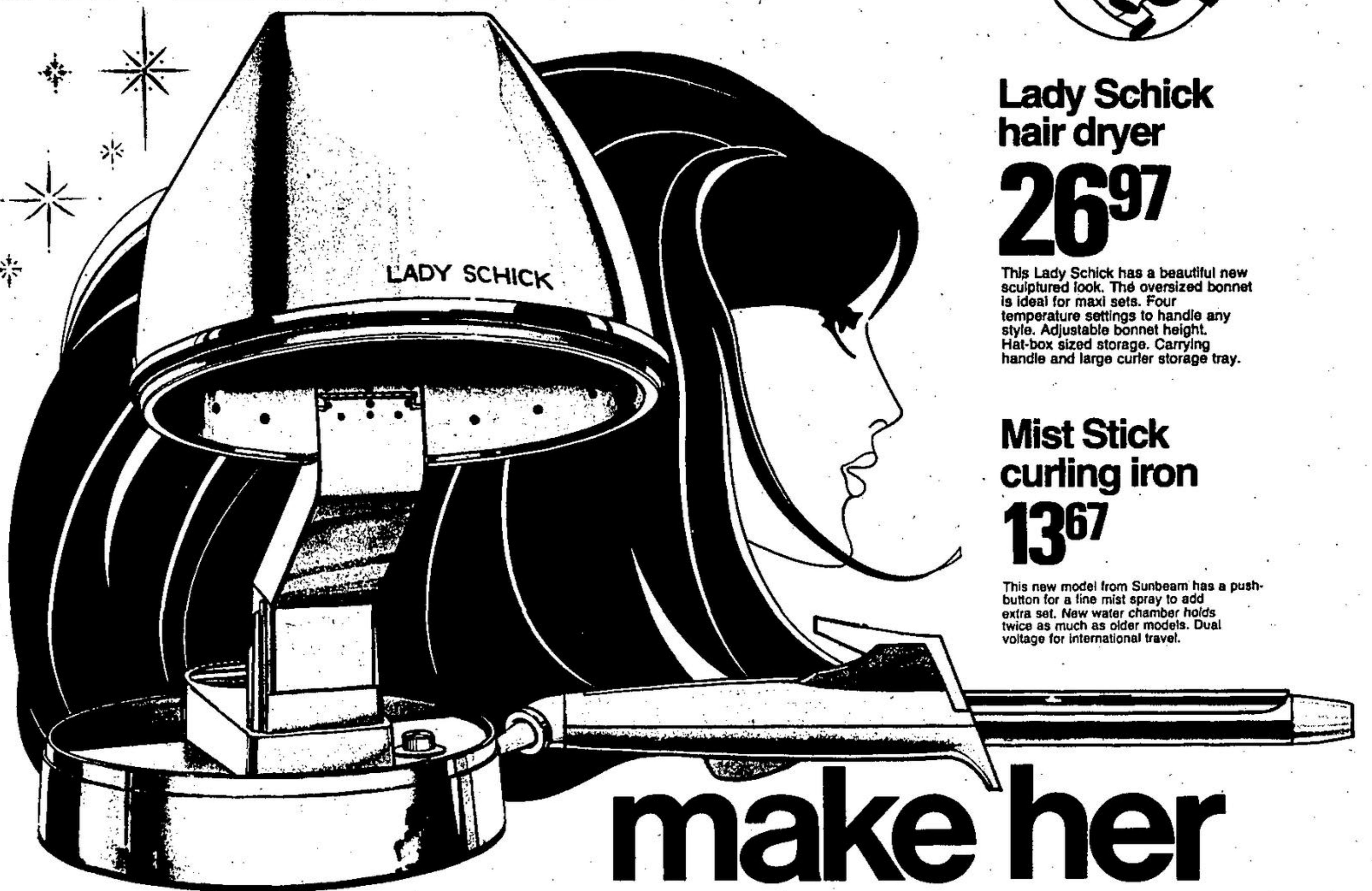
Lady Schick hair dryer