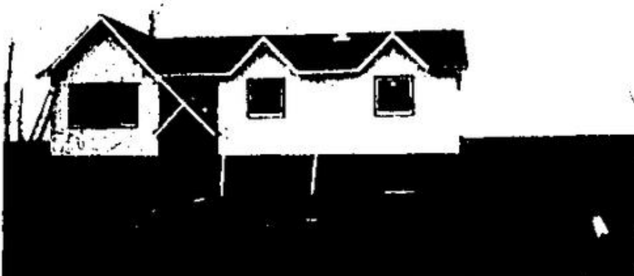
YOURS FOR CHRISTMAS

IN FOR CHRISTMAS —English Country Tudor, a most popular design and yet not duplicated. Blends with any location and suitable for the most discriminating buyer. Three bedrooms, broadloom and all the rest, one half acre bordering the village in tune with prestige homes. Only $46,900.