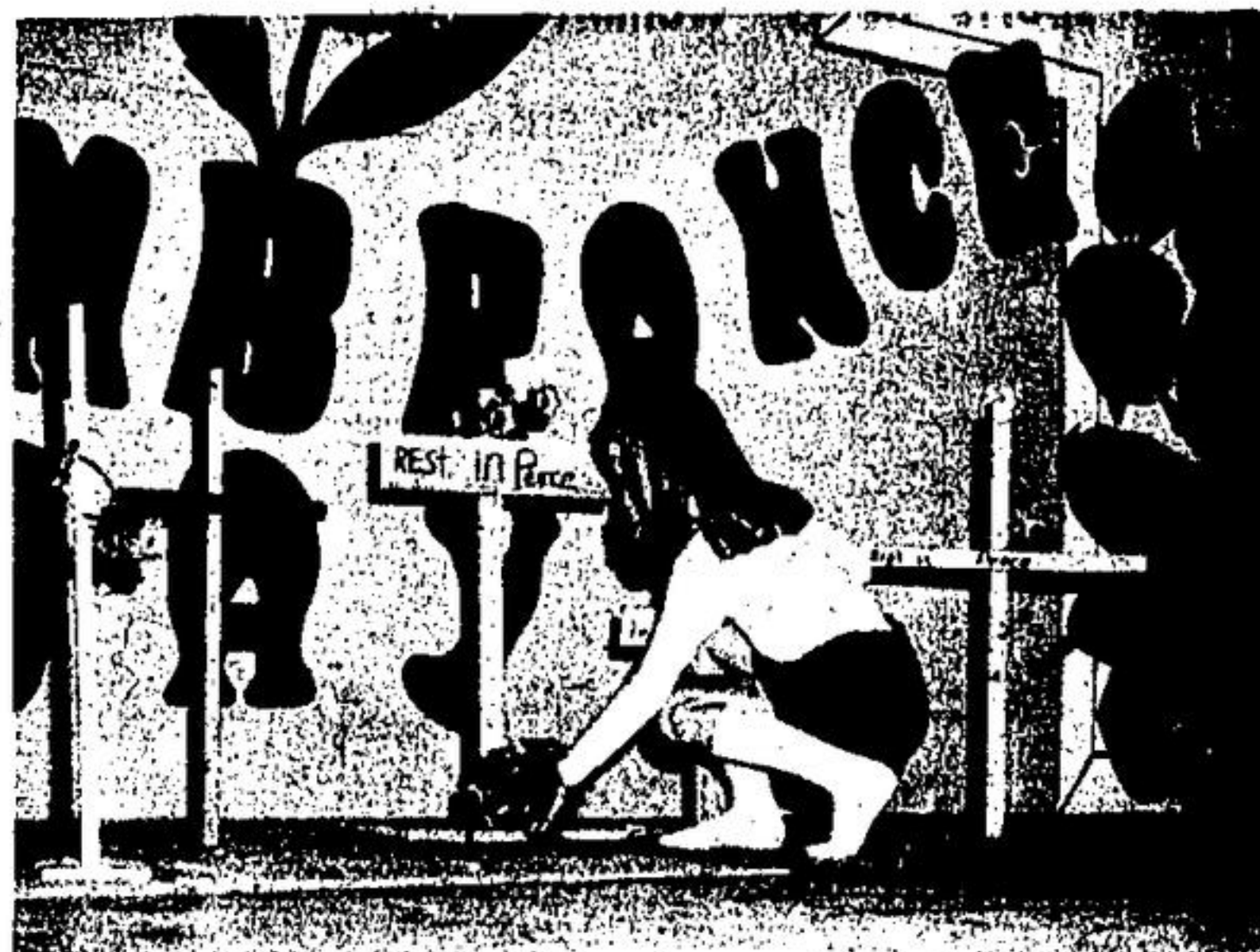
WHERE HAVE ALL THE FLOWERS GONE?