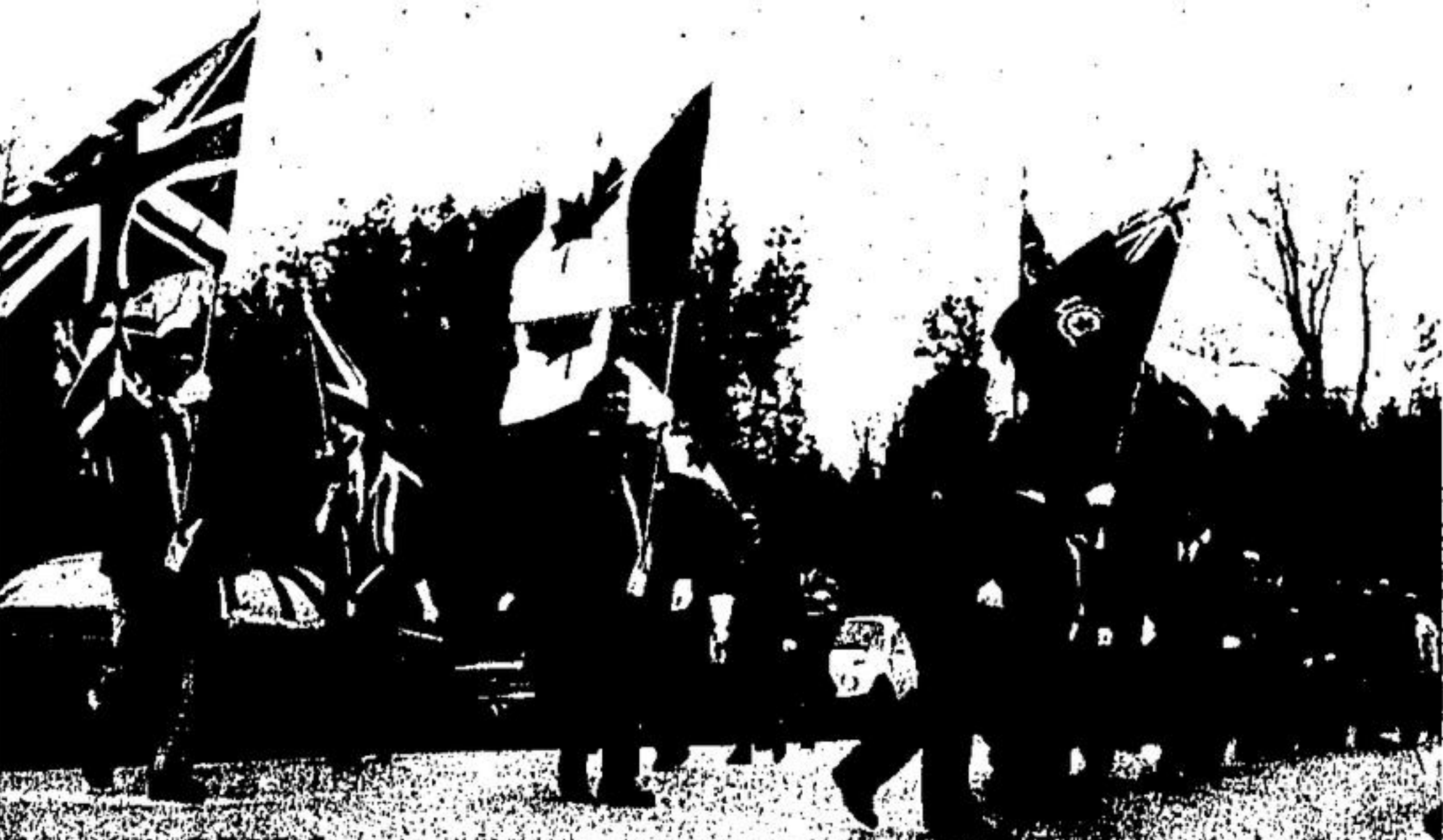
LEGION COLOR PARTY WHEELS INTO REMEMBRANCE PARK