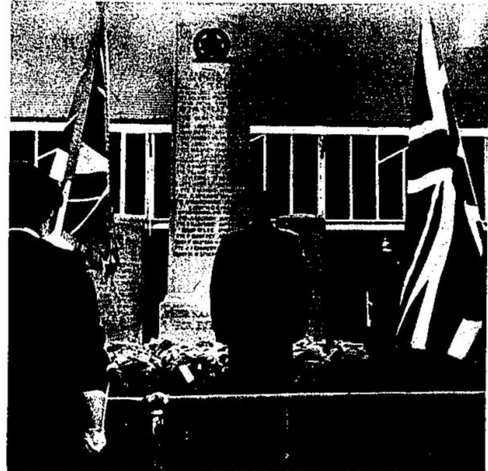
ALLAN BUCHANAN STANDS TO ATTENTION AT ACTON