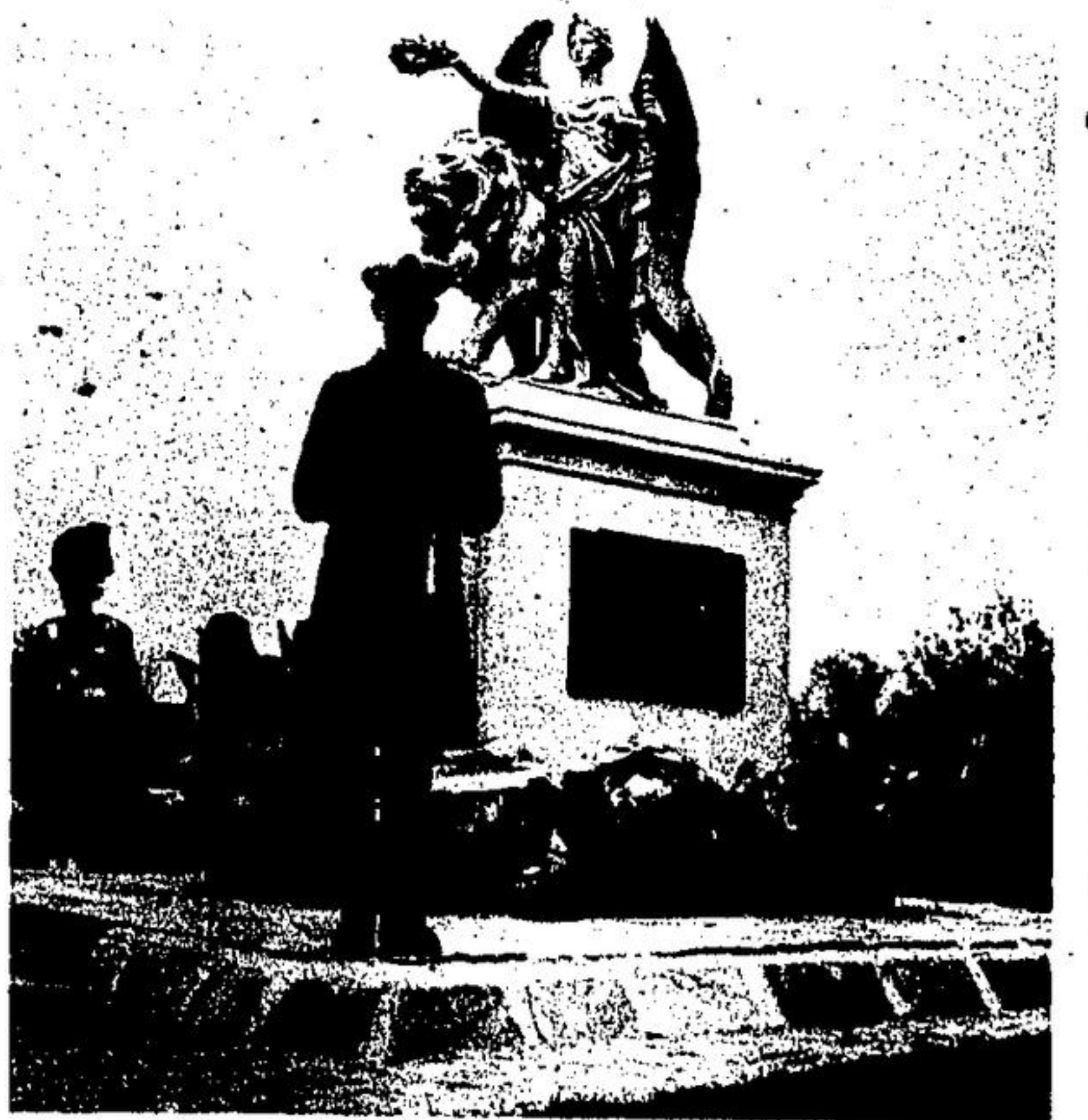
IN SILENT MEMORY OF THE WAR DEAD

Gusty winds knocked some of the wreaths off their wire stands even as they were being deposited at cenotaphs. Except for fighting that is still reported in Indo-China, Remembrance Day 1973 dawned on one of the most peaceful times in the world's history. For Canadians, it was cause to remember more than 100,000 servicemen who died in two world wars and the Korean conflict.