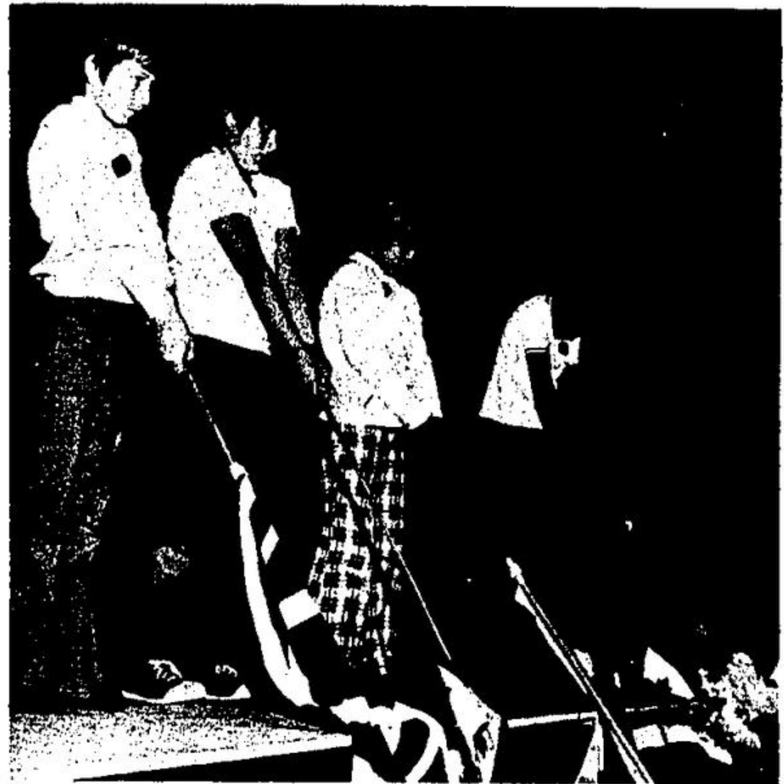
MINUTE OF SILENCE AT GEORGE KENNEDY SCHOOL