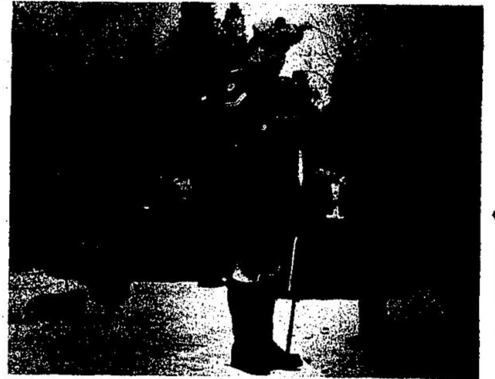
HALTON MP TERRY O'CONNOR BOWS AT CENOTAPH