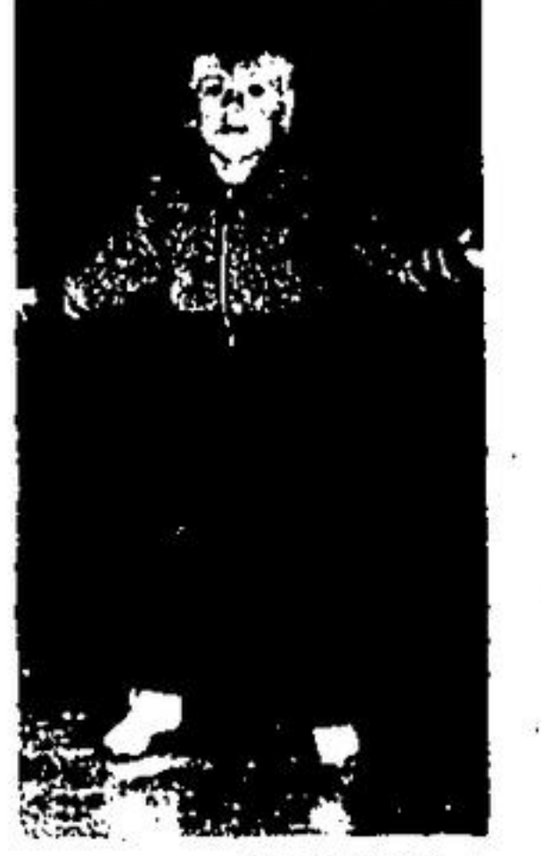
This young lady was just one of nearly 40 pre-schoolers taking part in the Georgetown Figure Skating Club's skating program. Held every Monday afternoon, the club provides ice time and instructors for all pre-school age children. For more pictures, see page seven.