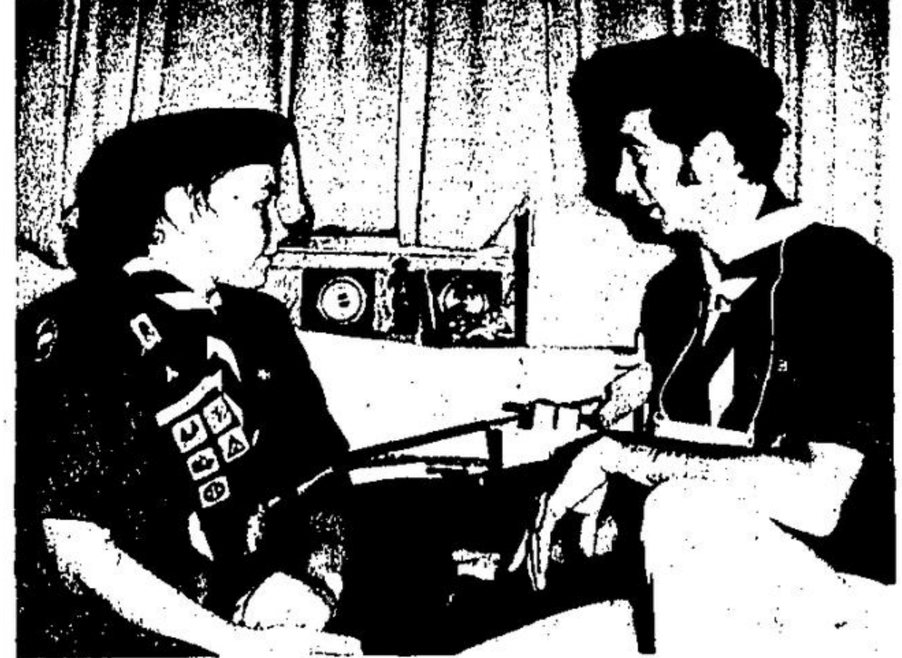
POPULAR SCOUTER LEAVES