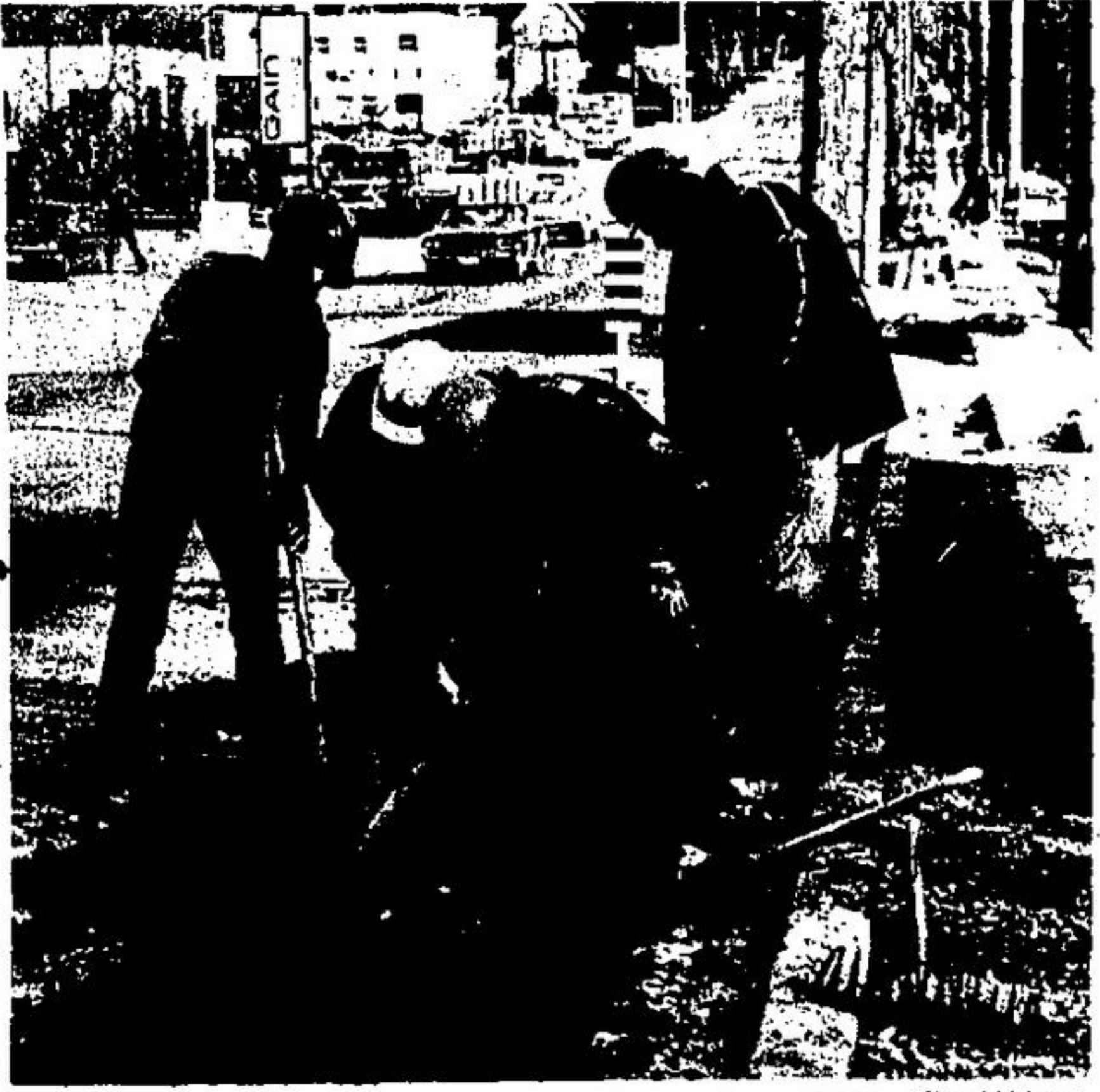
WORKING ON THE STREET

Return Postage Guaranteed $7.50 per year, Single Copy Price: Fifteen Cents