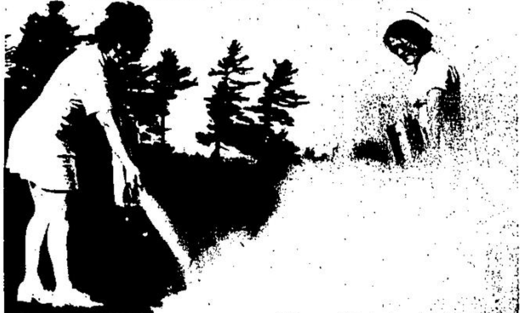
NURSES at Georgetown District Memorial Hospital got a practical lesson in fighting a fire, when they handed extinguishers to put out a blaze started by members of the Georgetown Fire Department. Here, two members of the staff handle soda-acid extinguishers to douse the fire, and create a little smoke in the process.