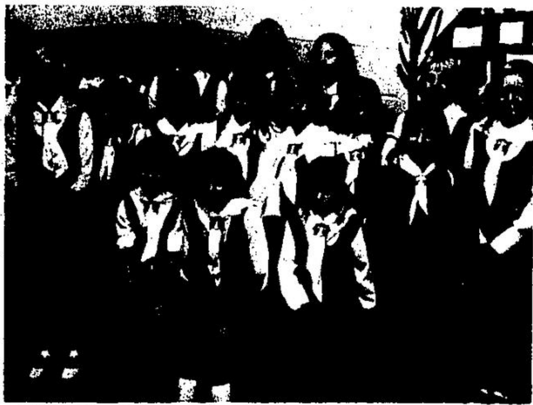
GEORGETOWN CALVINETTES AT OPENING MEETING