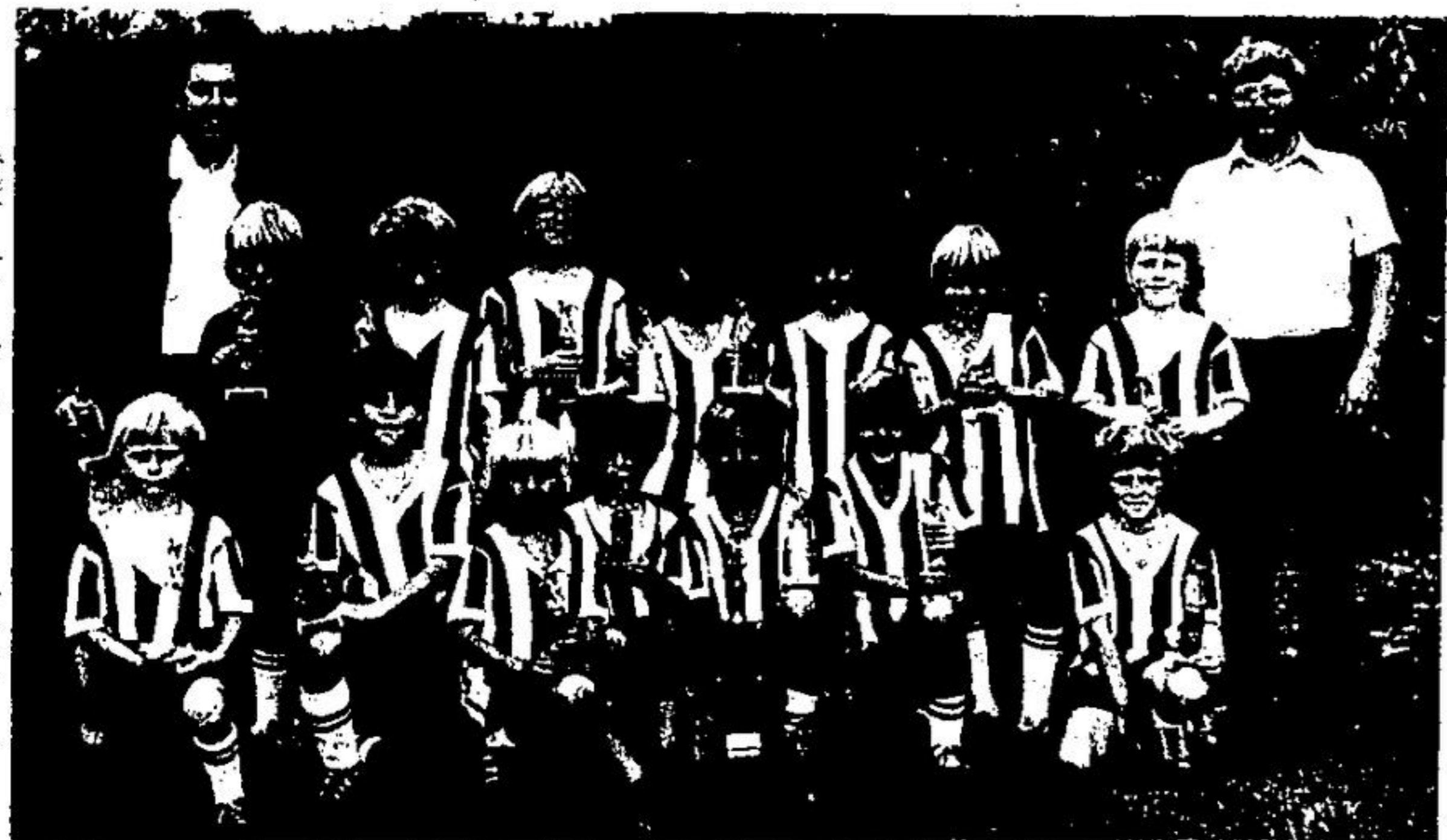
SQUIRT BOOMERANGS, LEAGUE WINNERS