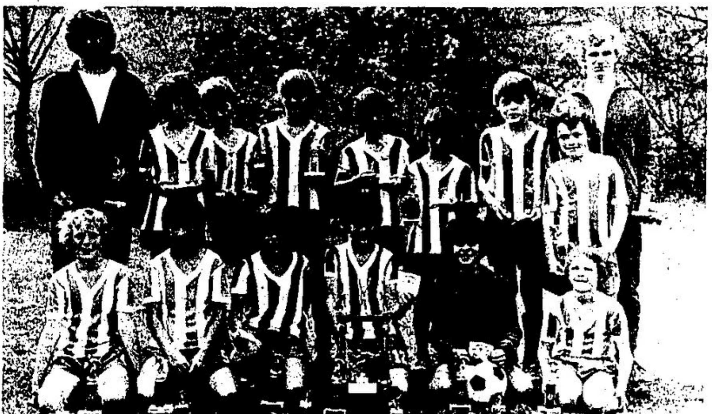
MAJOR ATOM FLYERS, LEAGUE WINNERS