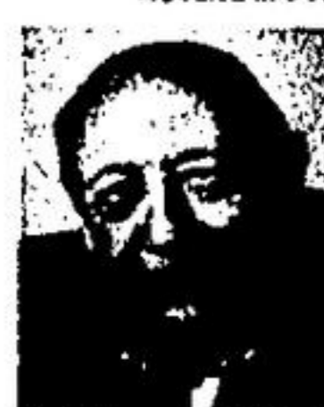
GORDON SINCLAIR "Let's Be Personal" and "News and Comment" 11:45 and 11:50 a.m.