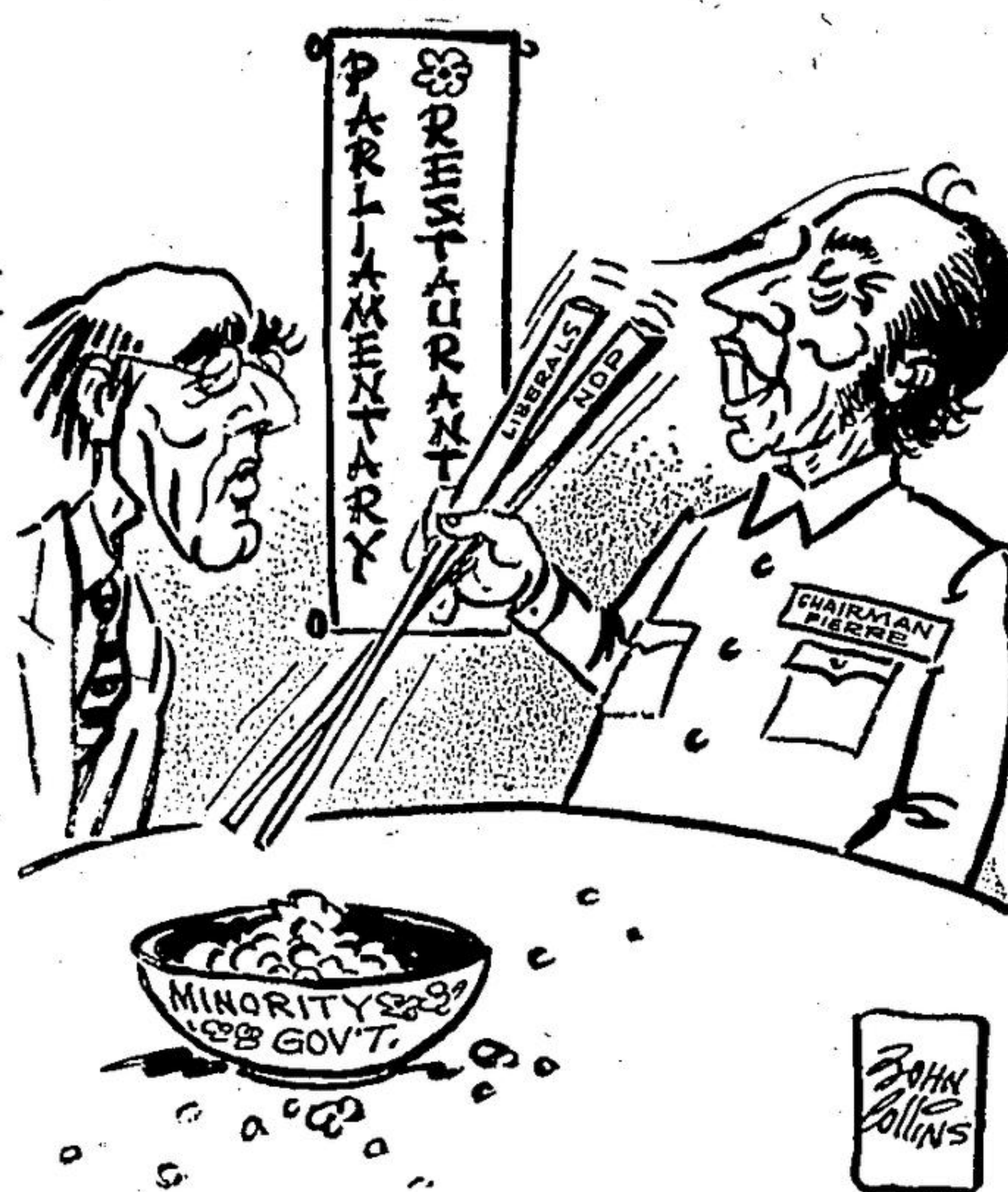
"IT'S EASY WHEN YOU GET THE HANG OF IT"