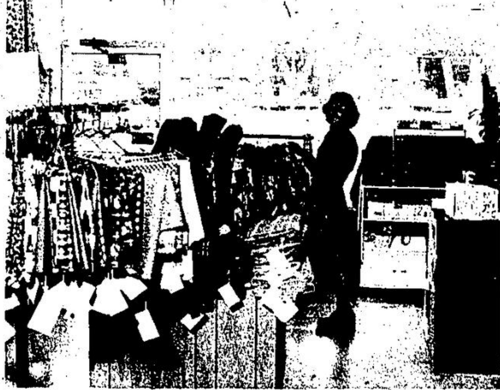
INTERIOR OF GEORGETOWN FABRICS STORE