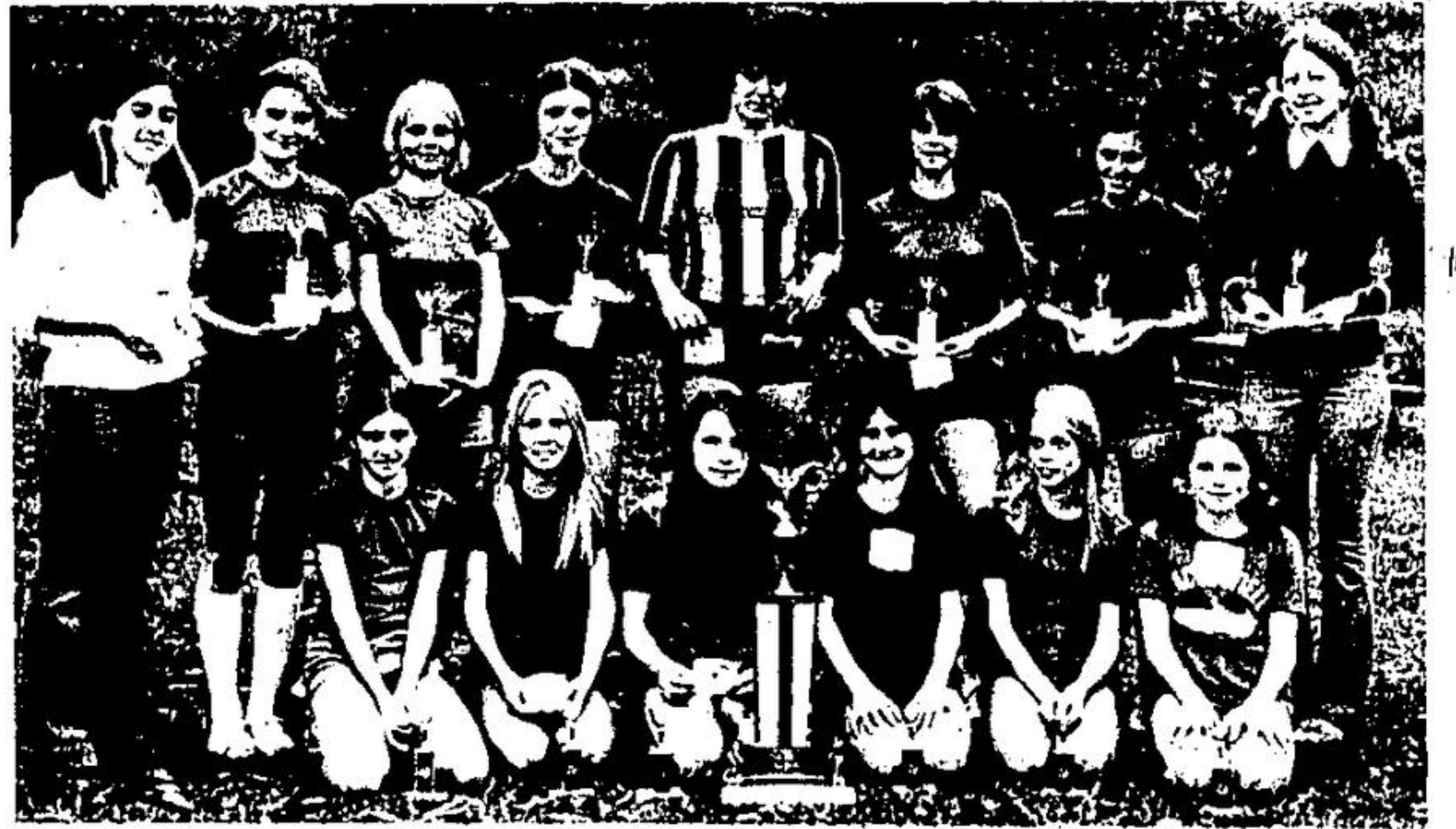
PLAYOFF WINNERS IN SOCCER

Other events planned by the GT Motor Sport Club include a driving skill test Nov. 4, in the Zeller's parking lot, a three-hour rally, starting at Cedarvale, Nov. 25, and the annual Moby Dick Economy Run, sometime in December. All motor sport enthusiasts are invited to attend general meetings of the club. The next meeting is Nov. 19, in Cedarvale.