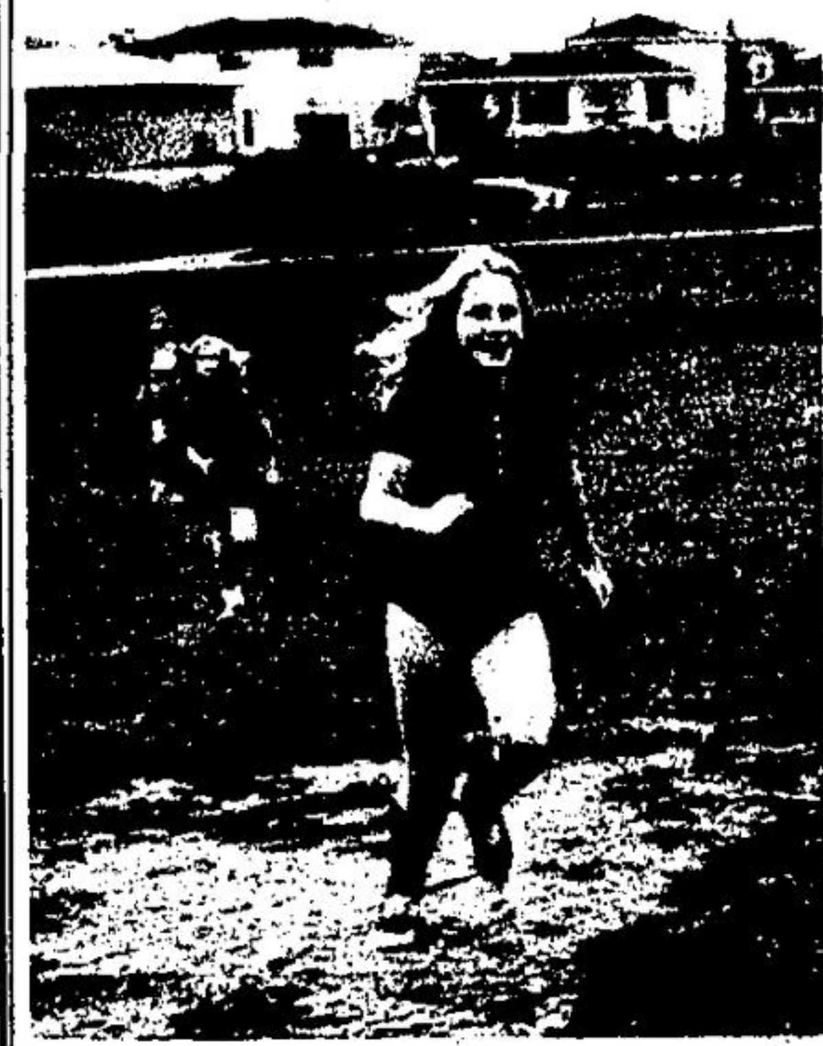
RUNNERS CROSS Joseph Gibbons Park en route to the finish line in a cross-country event for Kennedy junior public school pupils last week.