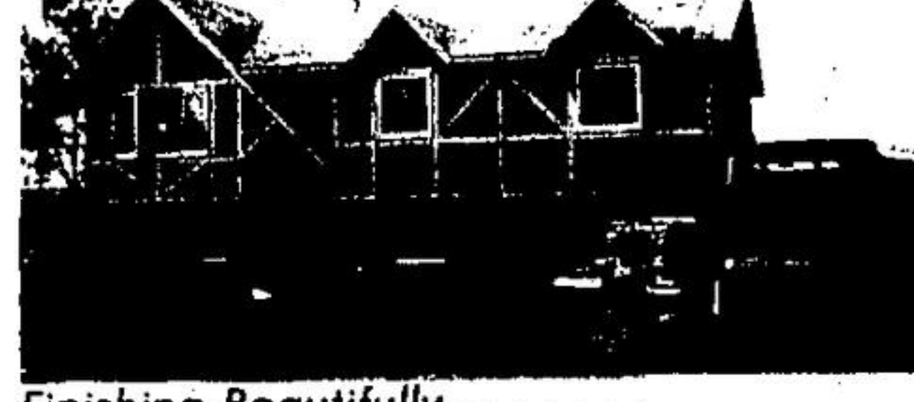
Finishing Beautifully . . . . .