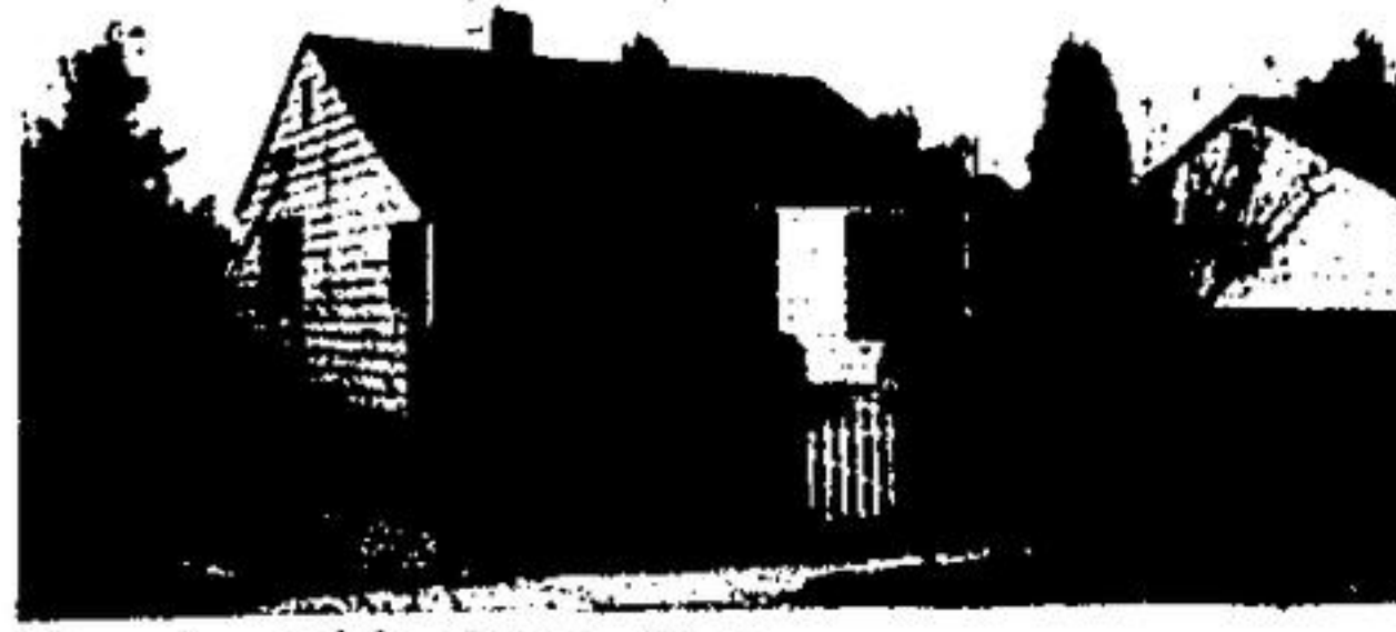
Comfortable Price Too. . . . .