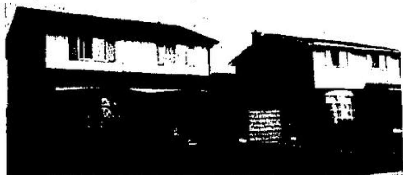
You Just Can't Miss. . . . .

For Fast Action — Put Your Home in This Feature Spotlight