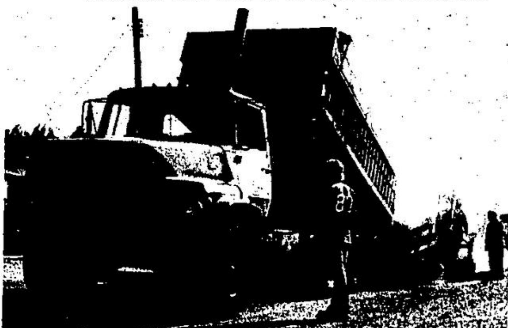
A HEAVY load of asphalt is dumped into the spreader as King Paving and Materials of Oakville moves ahead with resurfacing of Georgetown streets. This big truck, and others like it, have 12 rear wheels, with a third axle that can be lowered to give extra load-bearing support. Gross vehicle weight is registered at 65,000 pounds, giving a payload of about 20 tons.