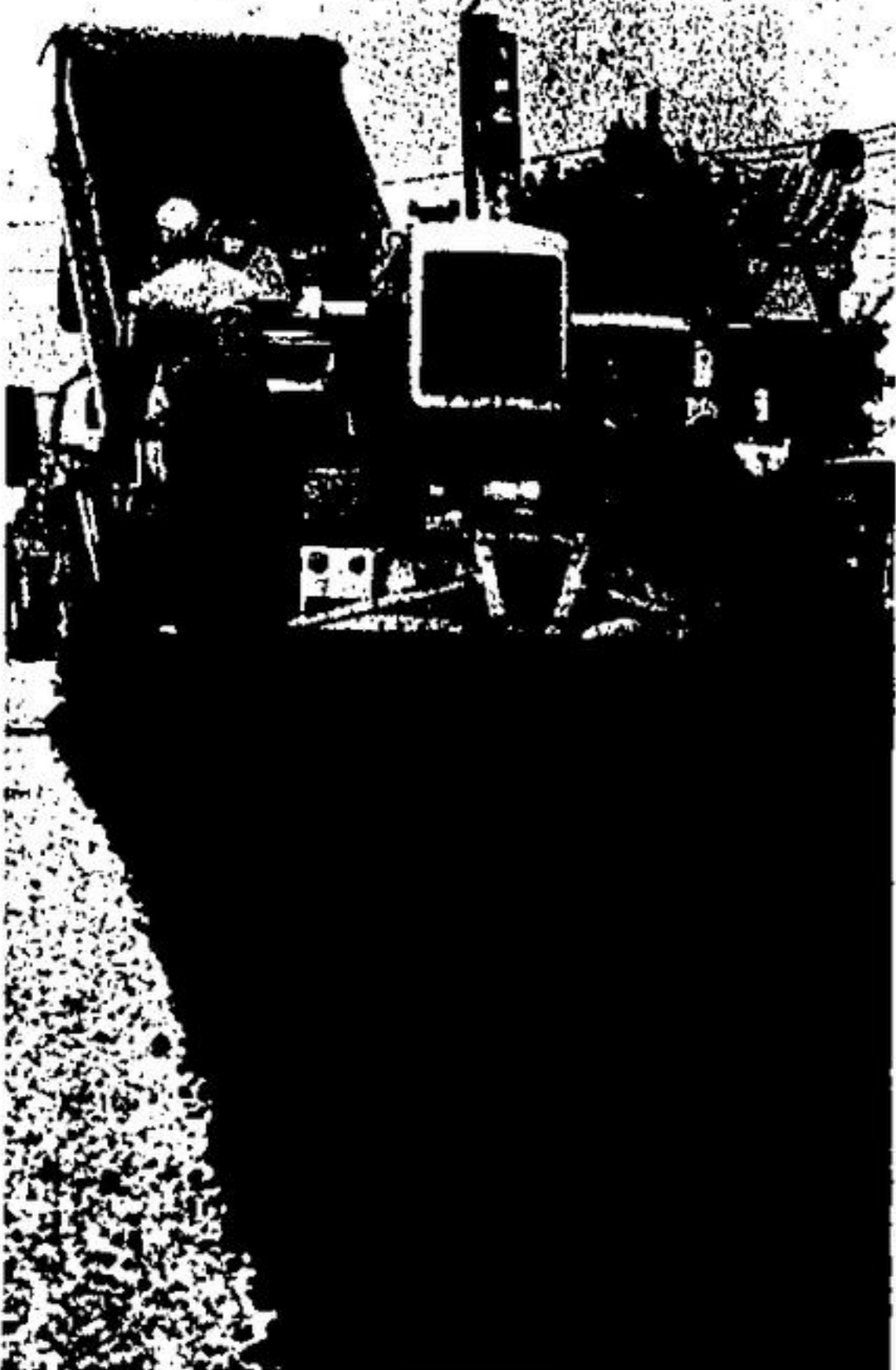
A NUMBER of streets in Georgetown are receiving application of new surface material. Here, a paving machine of King Paving and Materials of Oakville deposits a fresh layer of hot asphalt on Langston Crescent. Warm fall weather has been a boon to the pavers.