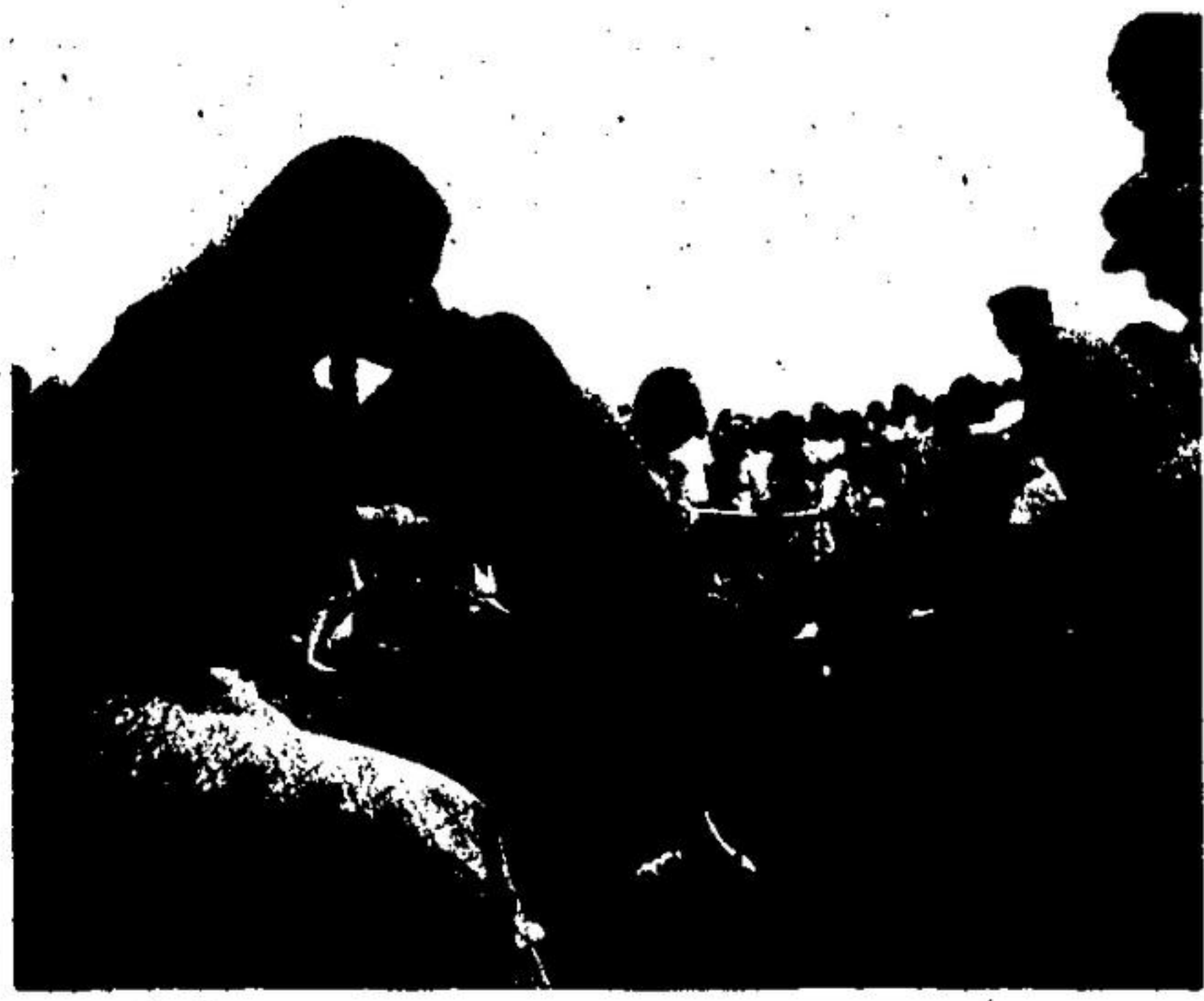
FEMALE TEACHERS TUG-OF-WAR.