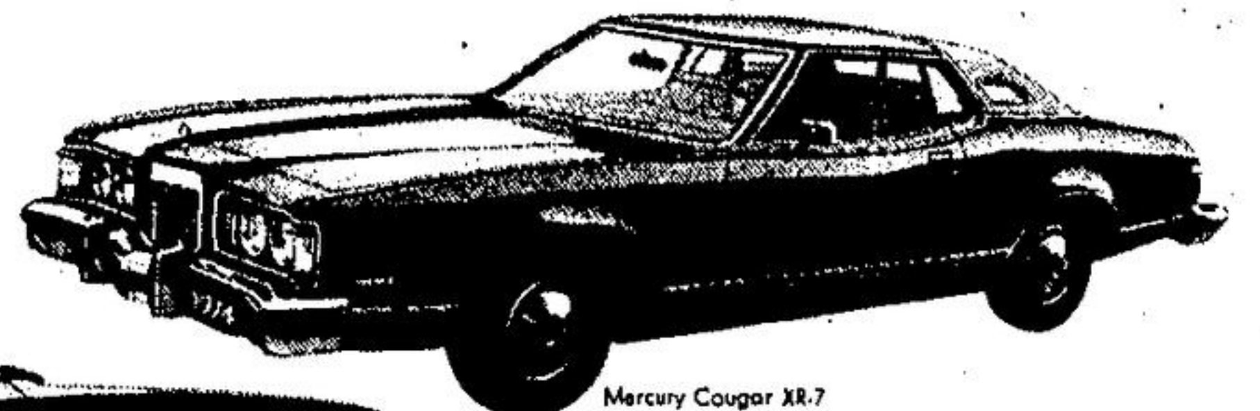
Mercury Cougar XR-7