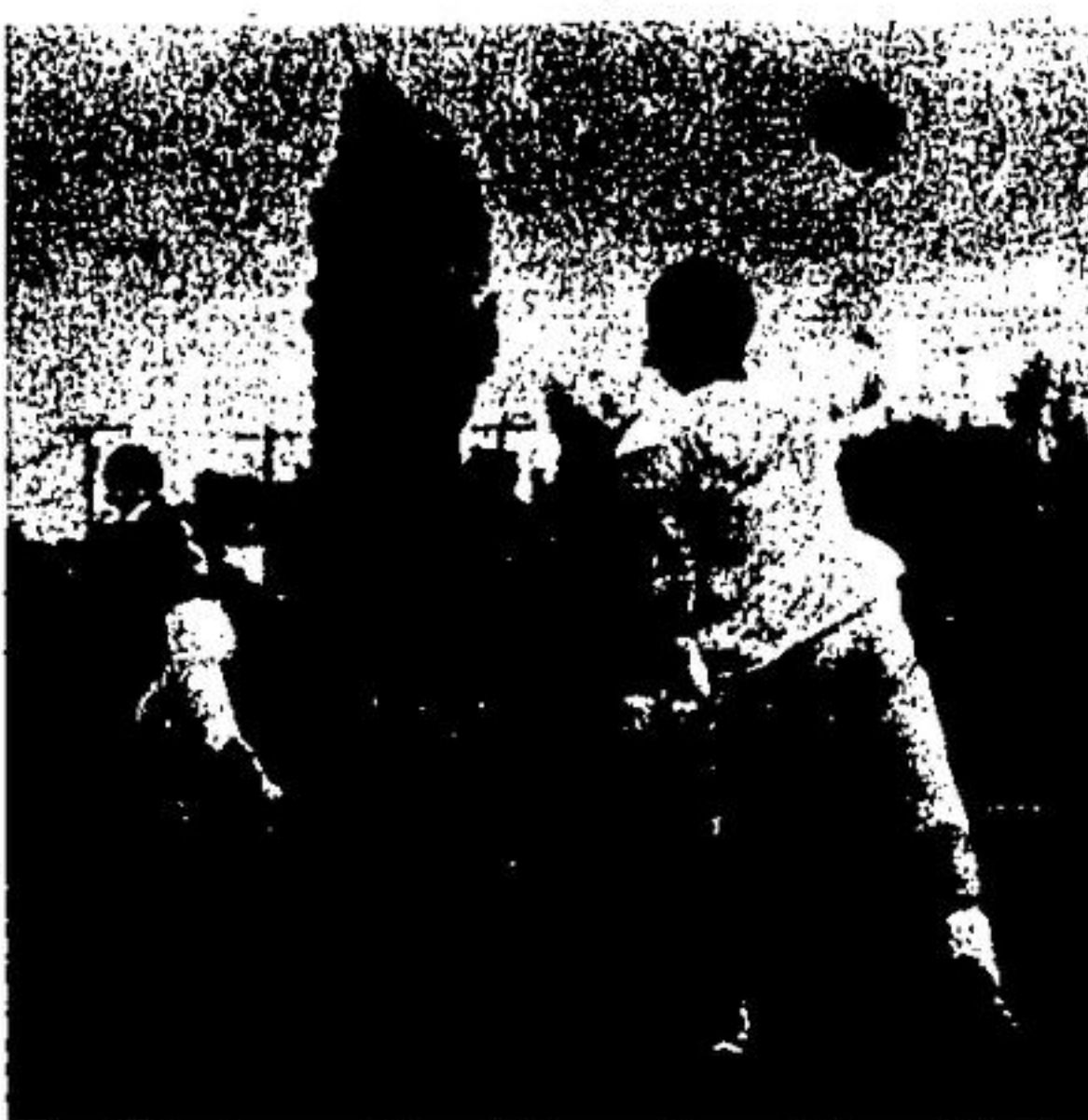
SCHOOL STARTING brings out the hopefuls, trying for