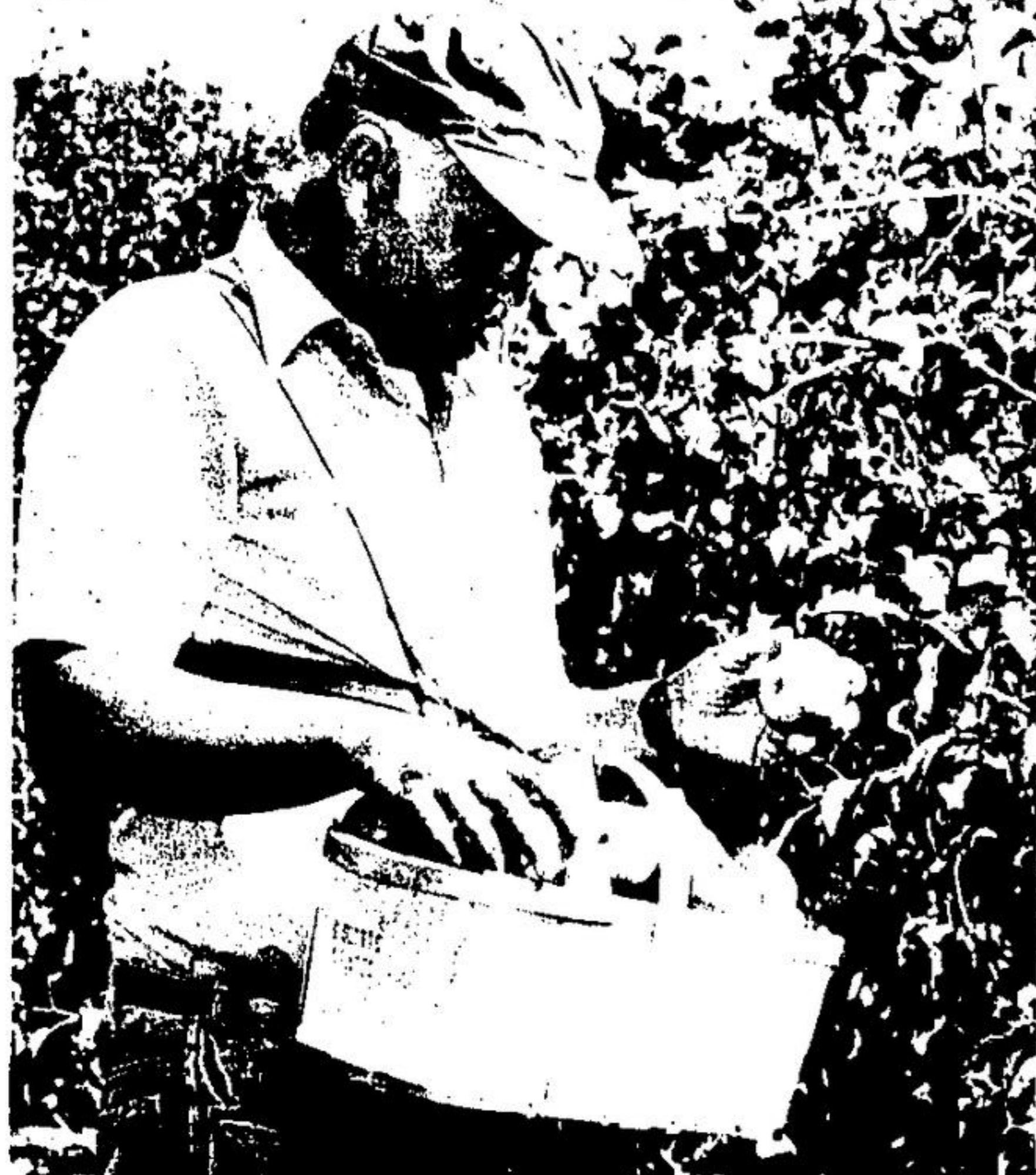
SIGNALS SUMMER'S END