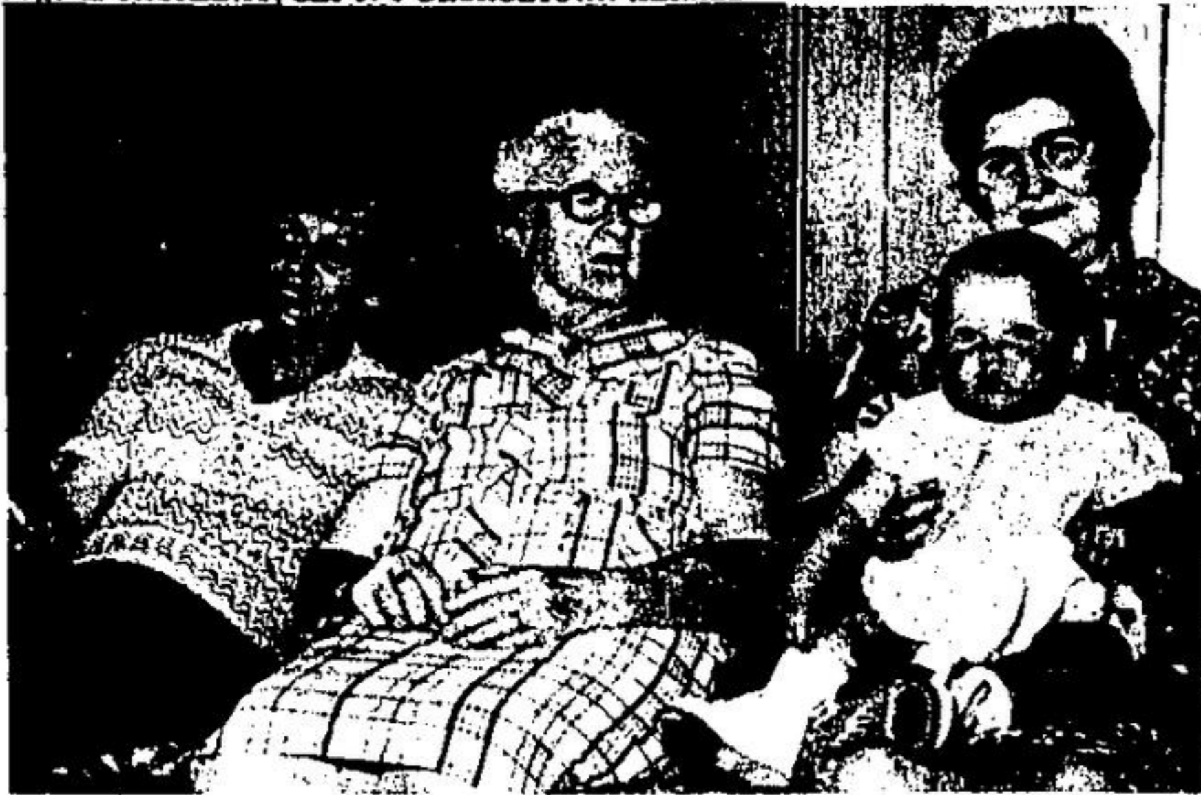
FOUR GENERATION PARTY