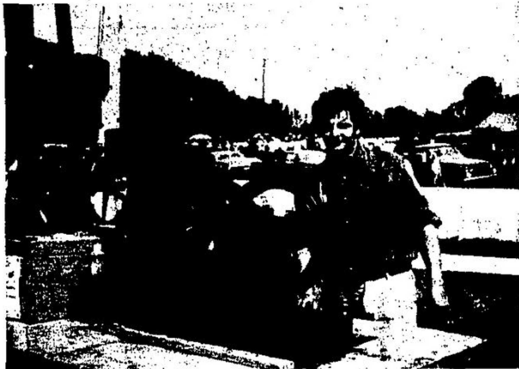
A LARGE number of the steam and antique machinery admired by visitors to Milton's Steam-