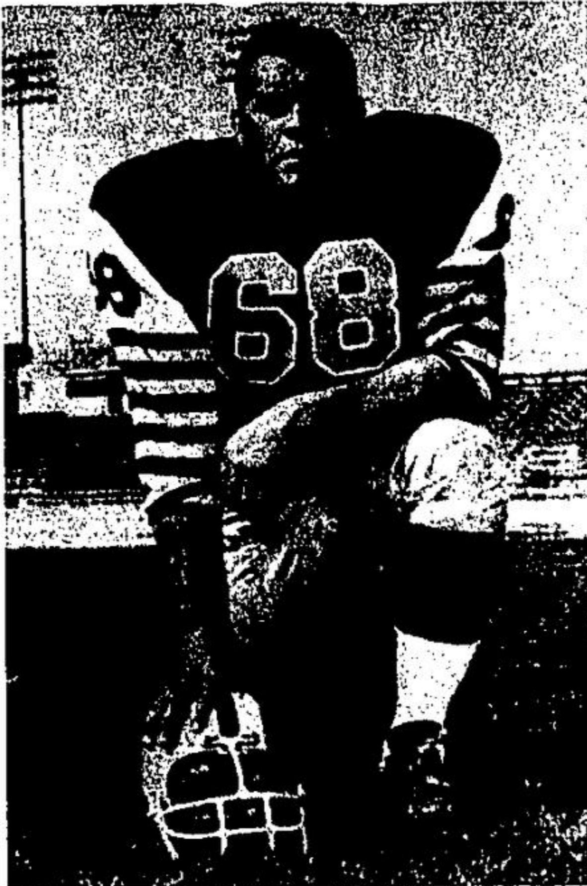
BIG ANGLE IS COMING

Georgetown and District Minor Hockey Association has scheduled its first general meeting for Wednesday, Sept. 5, at Centennial school. Rule changes, innovations and plans will be discussed.